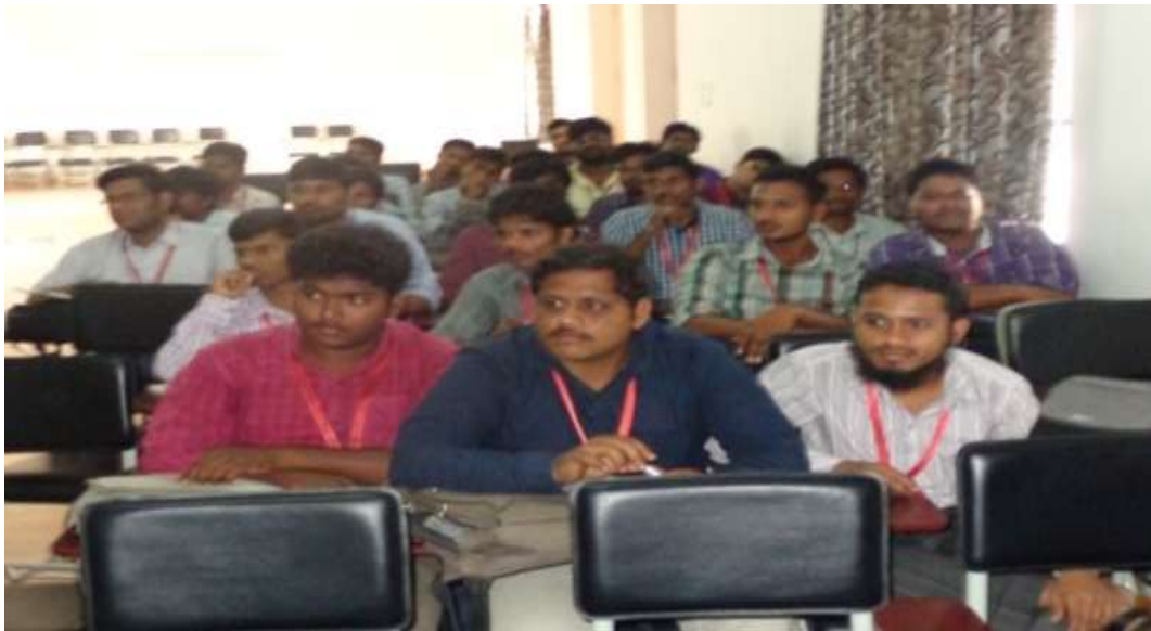
Students listening the lecture