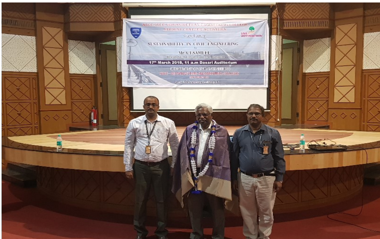
Felicitation to the Guest Speaker