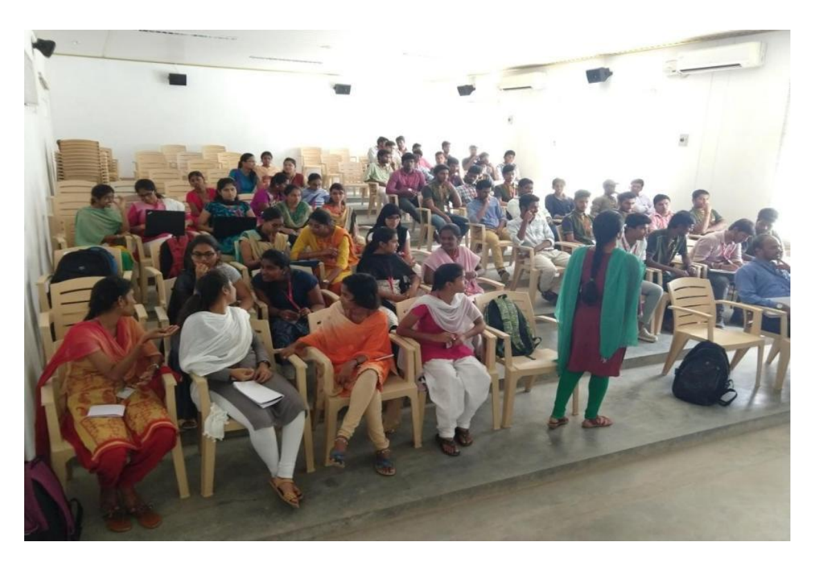
Participants' discussions during the break time