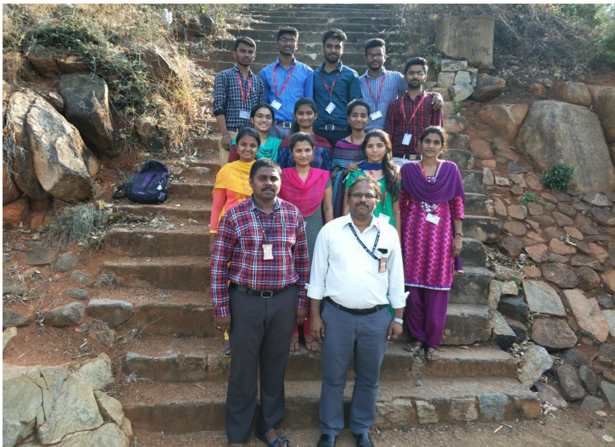
Faculty Advisor, Coordinator and Office Bearers of ASCE SVEC Student Chapter at the Social Gathering at Kalyani Dam, A. Rangampet