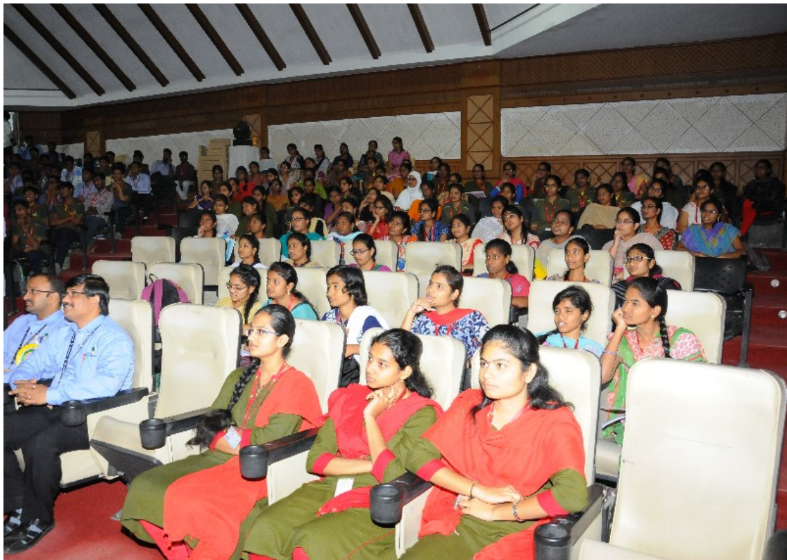
Faculty and Students Listening to the Seminar on “Innovations and Implementations (Concrete and Foundations) – Two Effective Tools for Success”