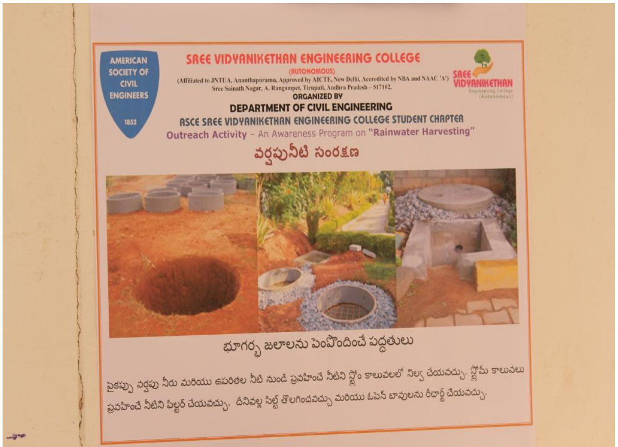
Posters on "Rainwater Harvesting" as Part of Poster Presentation