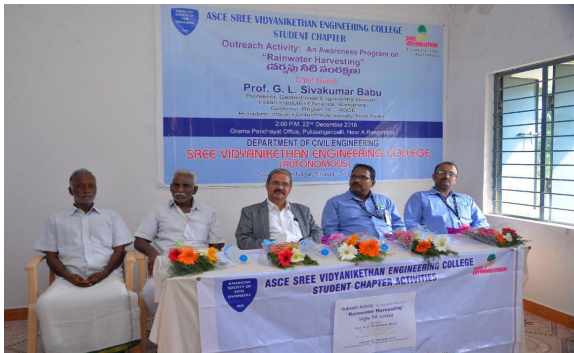
Chief Guest and other Dignitaries at the Inaugural of the Event