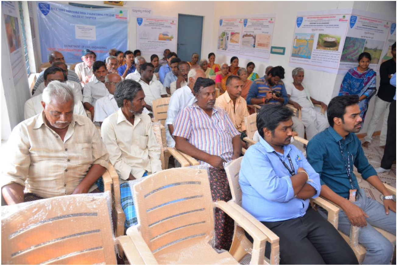
Faculty, Students and Villagers Listening to the Chief Guest