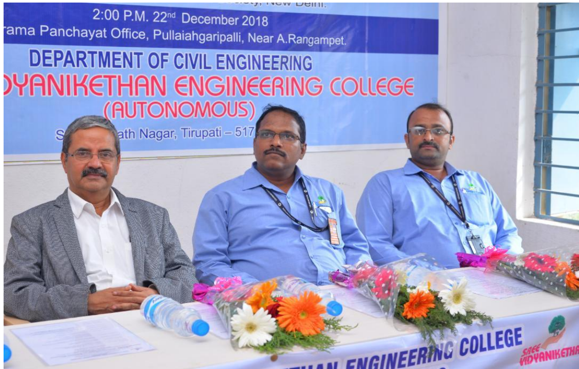
Chief Guest and other Dignitaries at the Inaugural of the Event