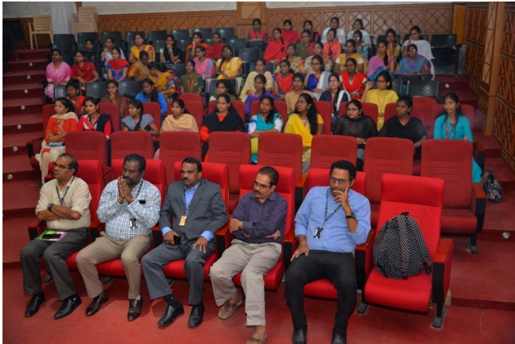
Dignitaries and Students Listening to the Chief Guest