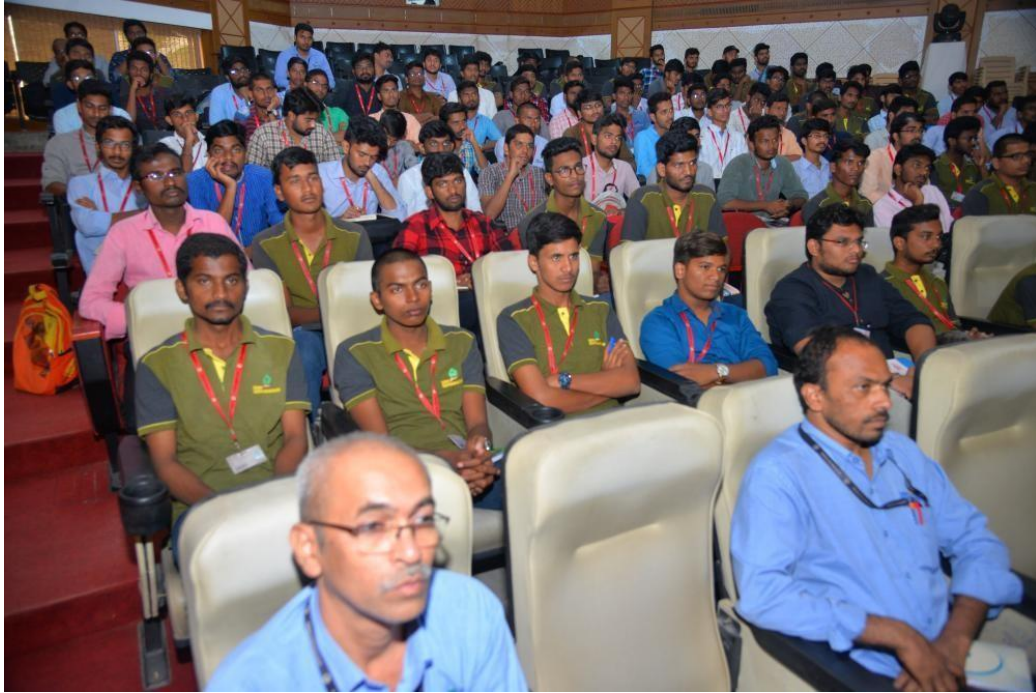
Faculty and Students Listening to the Chief Guest