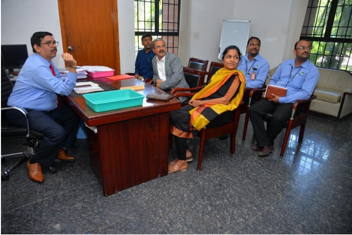
Chief Guest and Guests of Honour of the Event, Interacting with the Principal, SVEC