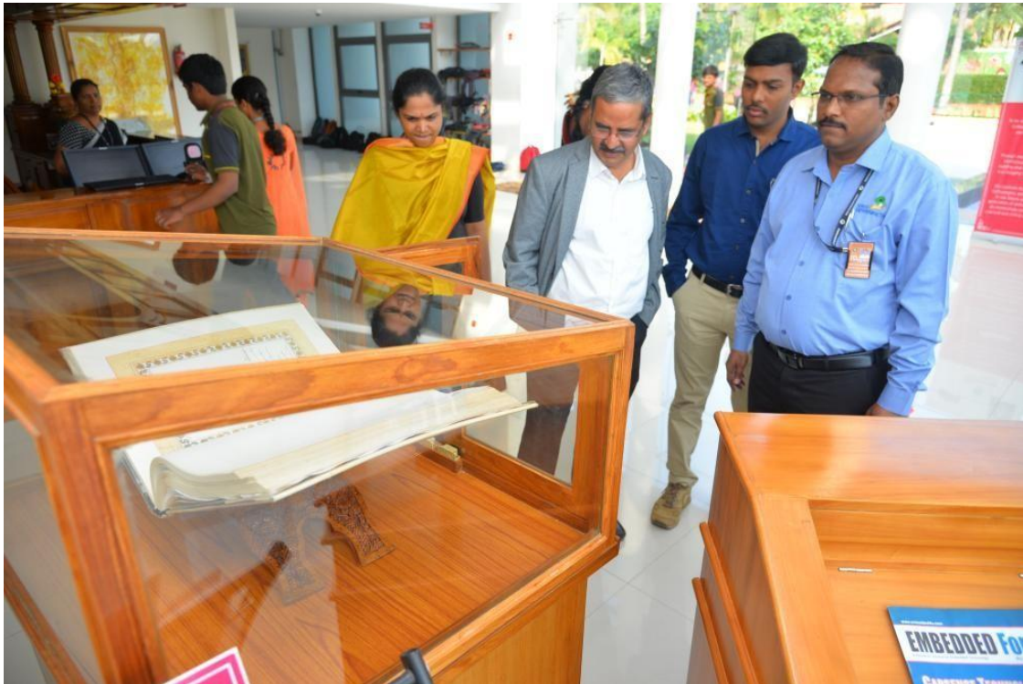
Chief Guest and Guests of Honour of the Event, looking at Constitution of India in Central Library