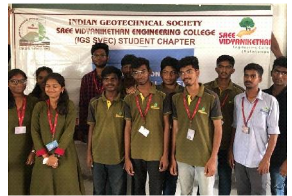
Student Participants in Chess Competition