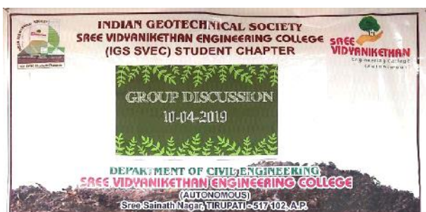
“Group Discussion” organized by IGS SVEC Student Chapter.

The Department of Civil Engineering of Sree Vidyanikethan Engineering College has organized a Group Discussion on “Current Trends and Happenings” under Indian Geotechnical Society Sree Vidyanikethan Engineering College (IGS SVEC) Student Chapter on 10 th April, 2019 from 9:00 a.m to 10:30 a.m. in Civil Engineering Seminar Hall. The main objective of the program is to create awareness among the students about the current trends and the things happening around the world. This program is helpful for students to develop the oratory skills, interpersonal skills and leadership skills.