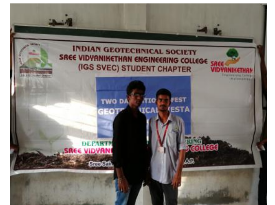
Winners of chess competition