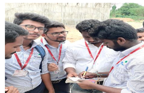
Student explaining about the construction procedure of Flyover