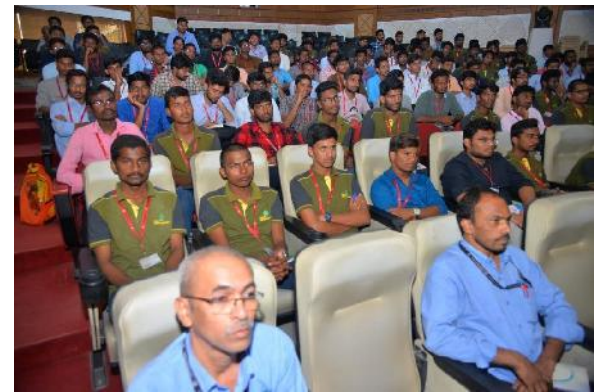
Faculty and Students Listening to the Chief Guest