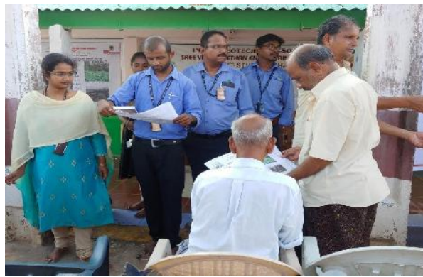
Faculty distributing the Pamphlets to Villagers

A total of 15 No. of IGS SVEC Student Members, 5 No. of Faculty and 4 No. of Lab Technicians along with 20 No. of Villagers have participated in the program.