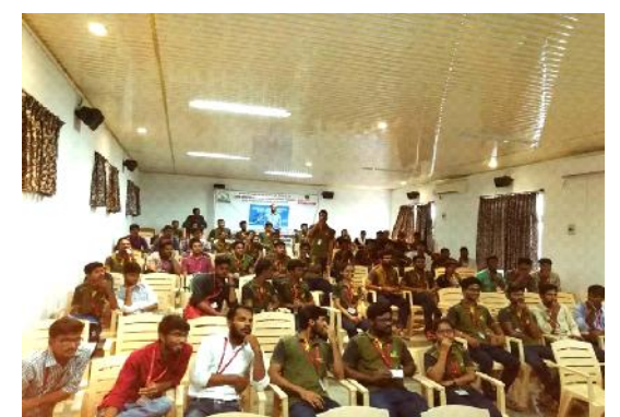
Participants during Quiz