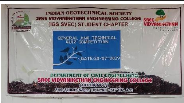
"General and Technical Quiz" organized by IGS SVEC Student Chapter

The Department of Civil Engineering of Sree Vidyanikethan Engineering College has organized a "Technical and General Quiz Competition" under Indian Geotechnical Society Sree Vidyanikethan Engineering College (IGS SVEC) Student Chapter on 20 th July, 2019 from 11:30 A.M to 1:30 P.M. in Civil Engineering Seminar Hall. The main objective of the program is to create enthusiasm to learn general knowledge and current affairs and thereby to develop an attitude to win and boost confidence among participants.