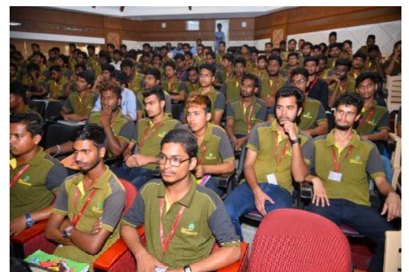
Students Listening to the Chief Guest