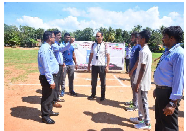
Principal, SVEC tossing the coin