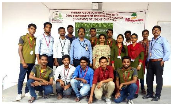
Participants with Faculty Advisor and Coordinator of IGS SVEC Student Chapter