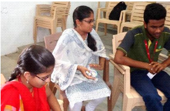
Group Discussion on "Importance of Vote and Individual Responsibility"