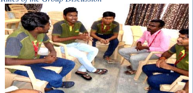
Group Discussion on “Reservation System of India”