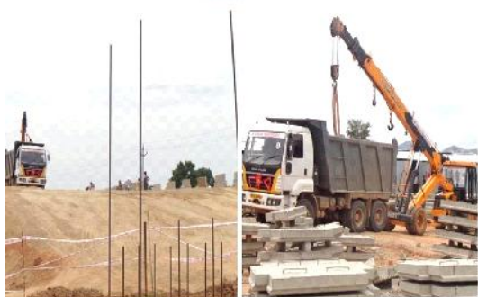
Construction Equipment at the Site