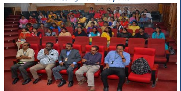
Dignitaries and Students Listening to the Chief Guest