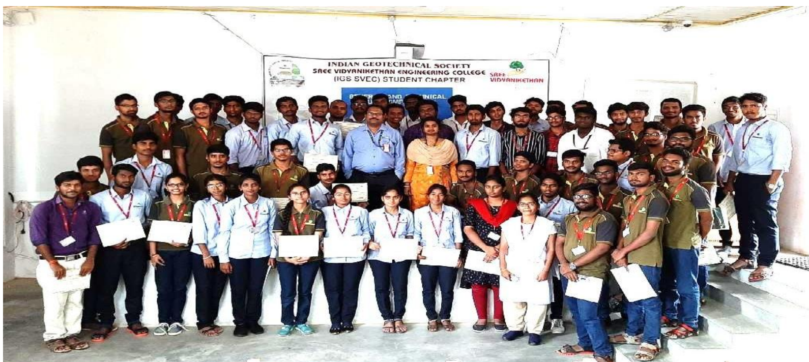
Participants with Faculty Advisor and Coordinator of IGS SVEC Student Chapter