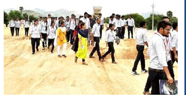
Students at the Construction Site