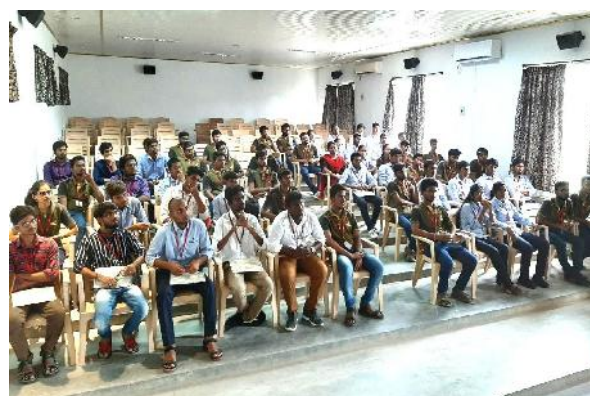
Students gathered for General and Technical Quiz