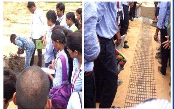
Construction of Geogrid Reinforced Earth