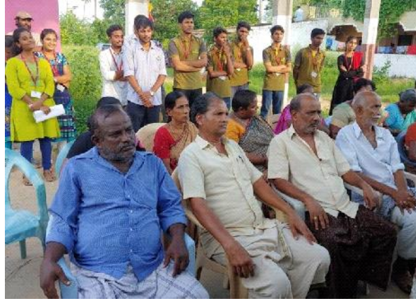
Villagers of Kuchivaripalli and Students of Civil Engineering Department, SVEC

them to ban chemical fertilizers, single use plastic items, improper drainage disposal, industrial waste and explained about various methods of organic farming through posters and pamphlets.