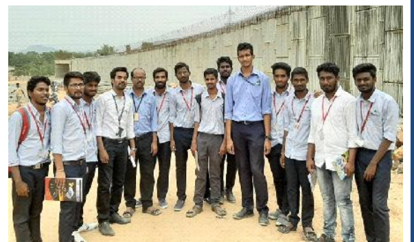
Students and Faculty at Construction Site

Field Visit helps students to experience and learn about construction site environment and to develop analyzing the theoretical knowledge with the practical conditions.