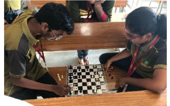
Participation of Students in Chess Competition