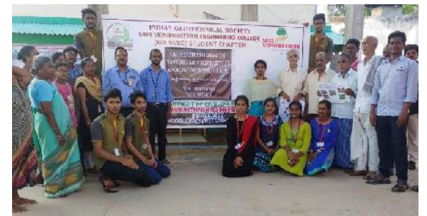
Group Photo of Faculty and Students of SVEC with the Villagers of Kuchivaripalli

On the whole, the event has proved successful. Activities like this help students to develop skills, establish contacts, and allowing them to improve the quality of life of others. The students will develop an attitude of giving something to society. Also, it creates realization in the budding engineers to innovate and work for society.