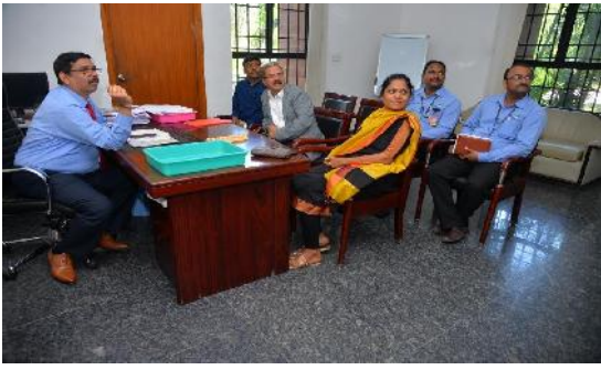
Chief Guest and Guests of Honour of the Event, interacting with the Principal, SVEC