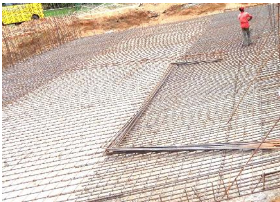
Reinforcement for Box Culvert