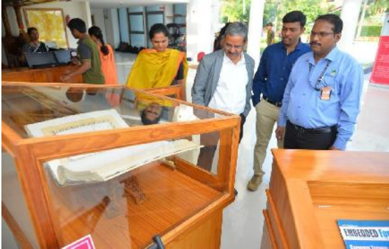
Chief Guest and Guests of Honour of the Event, looking at Constitution of India in Central Library