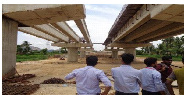
Railway Over Bridge Construction at Narasingapuram