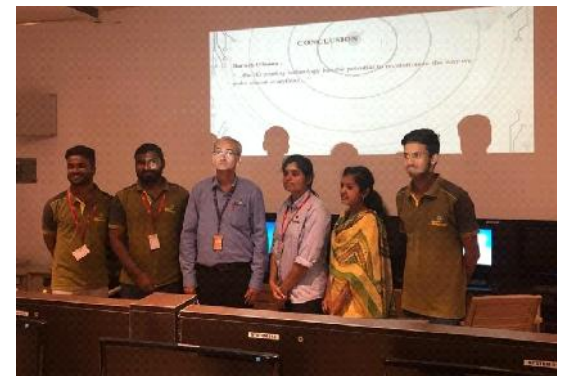
Student Participants in Paper Presentation Competition