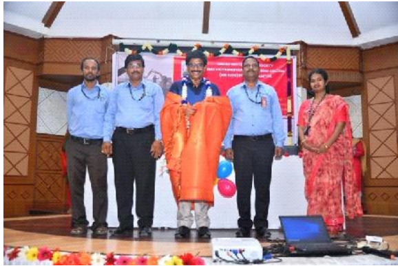
Felicitation to the Chief Guest