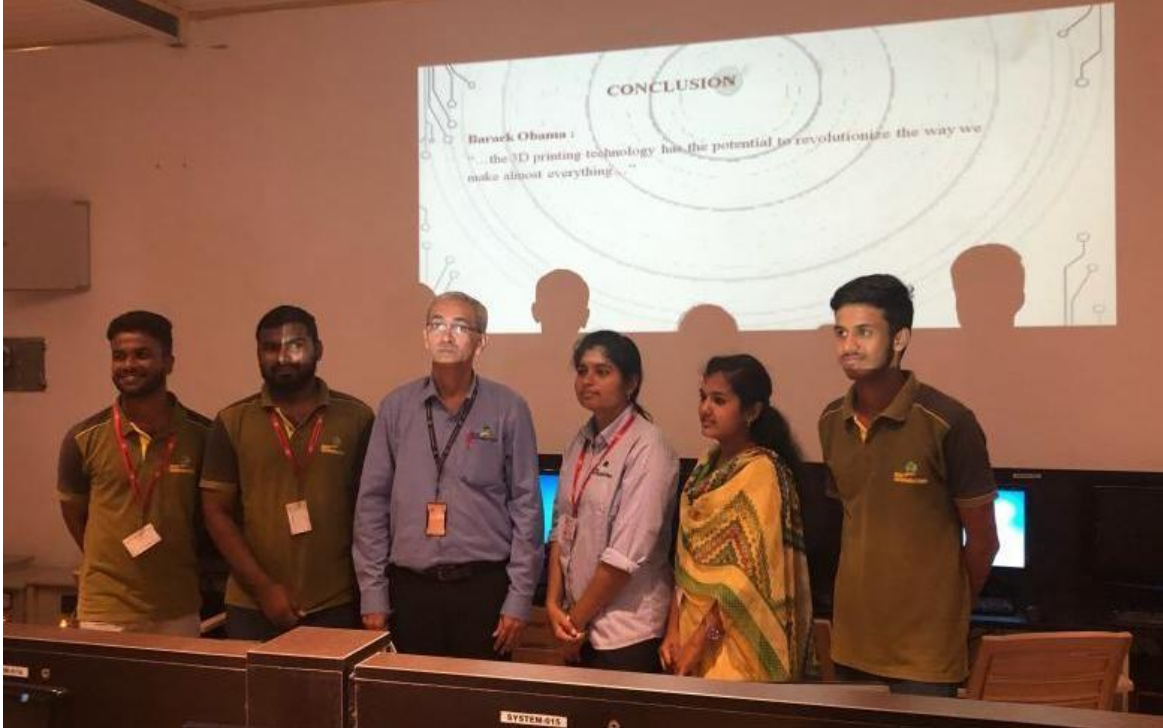
Student Participants in Paper Presentation Competition