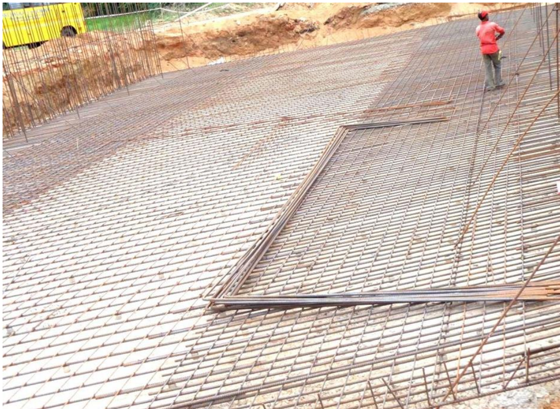
Reinforcement for Box Culvert