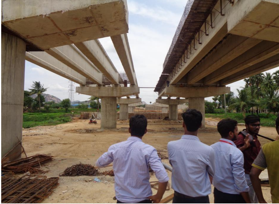
Railway Over Bridge Construction at Narasingapuram