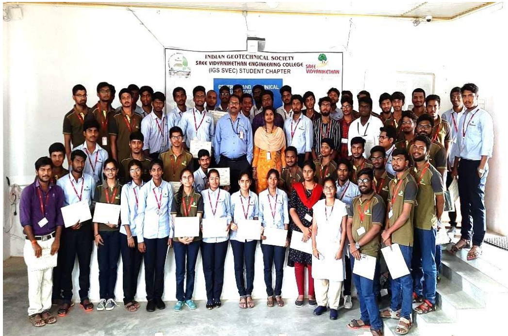
Participants with Faculty Advisor and Coordinator of IGS SVEC Student Chapter