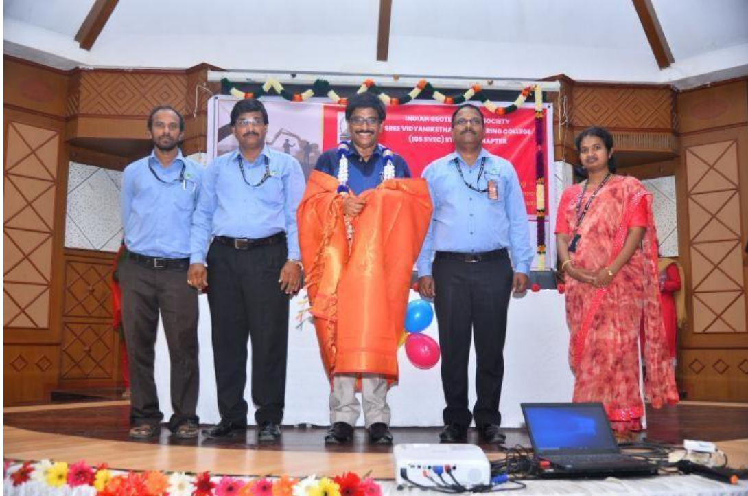
Felicitation to the Chief Guest