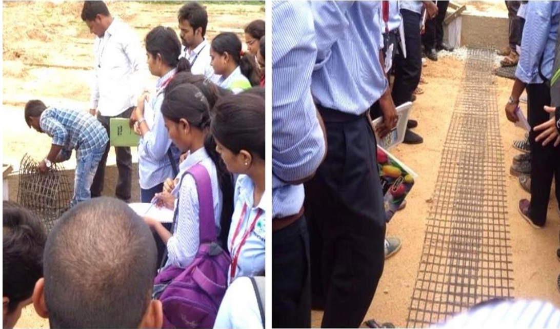
Construction of Geogrid Reinforced Earth