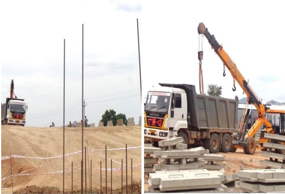
Construction Equipment at the Site