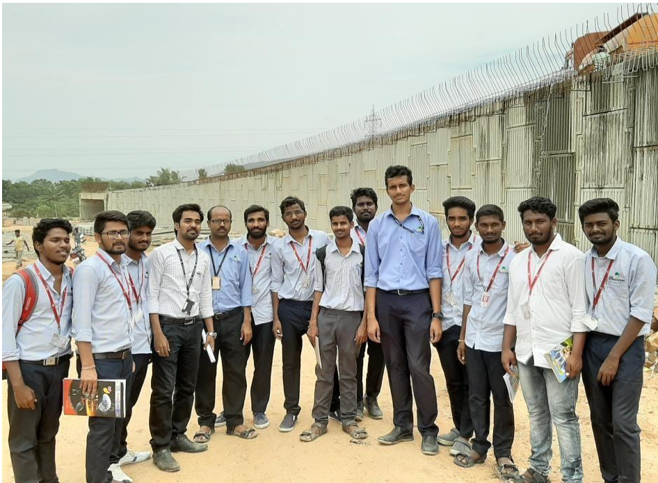
Students and Faculty at Construction Site