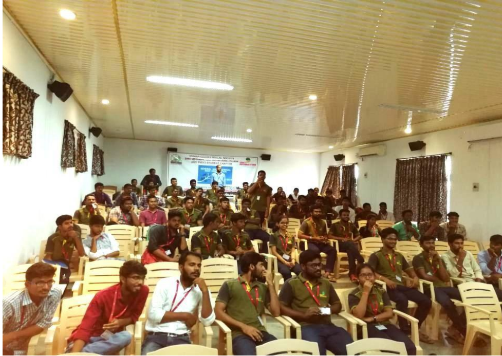
Participants during Quiz