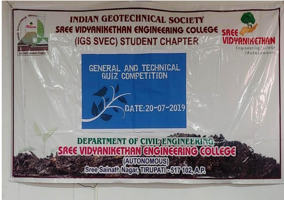
“General and Technical Quiz” organized by IGS SVEC Student Chapter