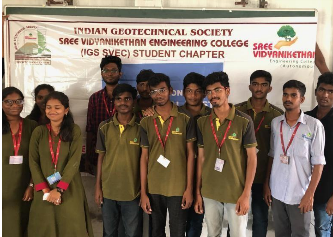
Student Participants in Chess Competition