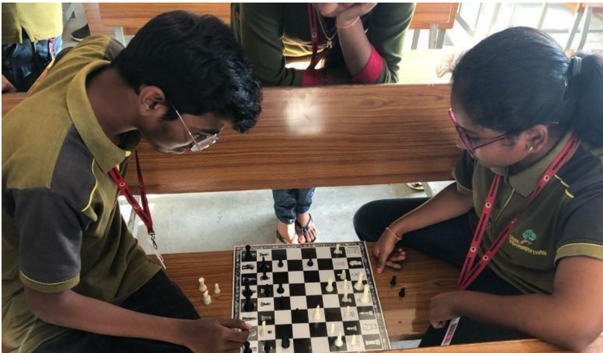
Participation of Students in Chess Competition