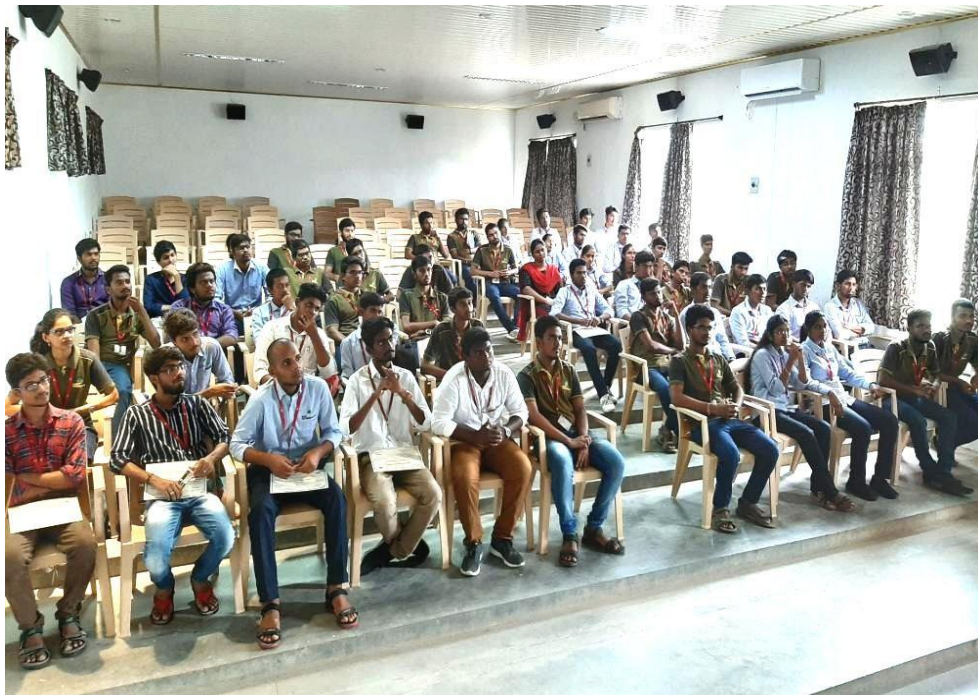
Students gathered for General and Technical Quiz