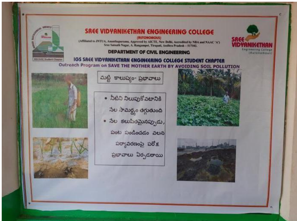
Posters explaining Causes, Effects and Solutions of Soil Pollution