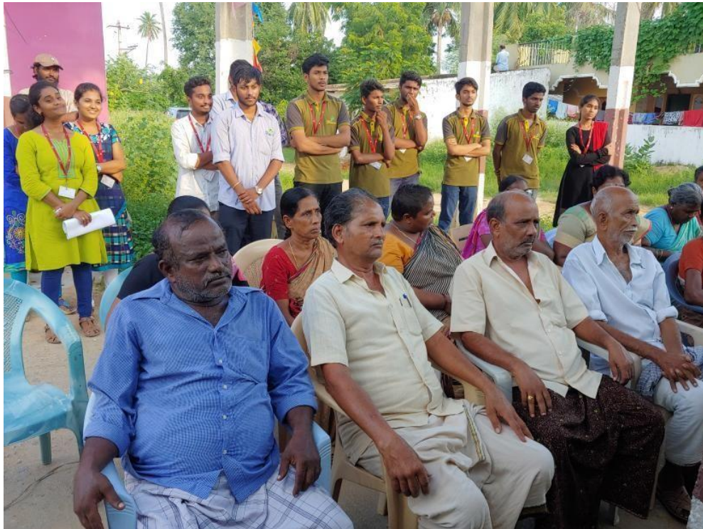
Villagers of Kuchivaripalli and Students of Civil Engineering Department, SVEC