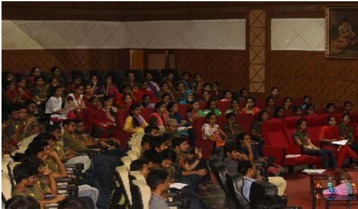
Faculty and Students Listening to the Chief Guest