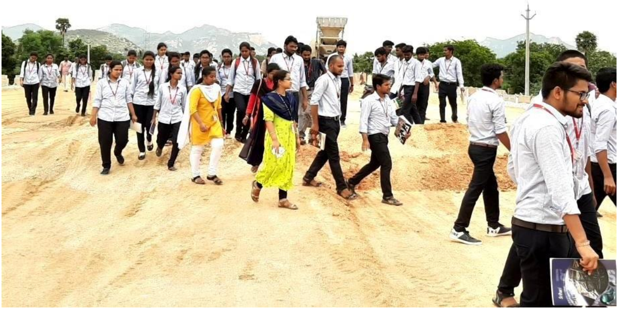
Students at the Construction Site