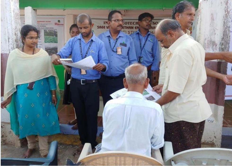
Faculty distributing the Pamphlets to Villagers