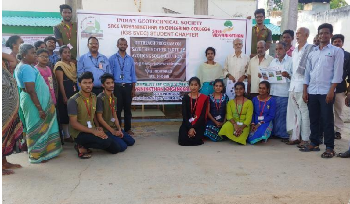
Group Photo of Faculty and Students of SVEC with the Villagers of Kuchivaripalli