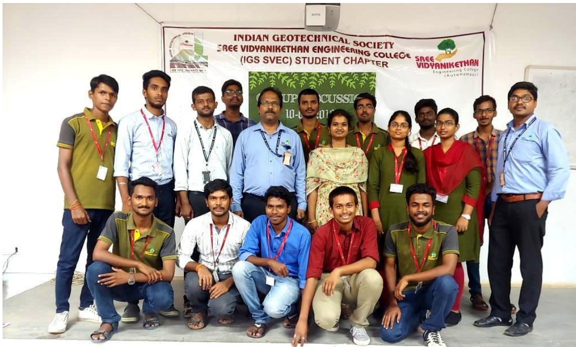
Participants with Faculty Advisor and Coordinator of IGS SVEC Student Chapter