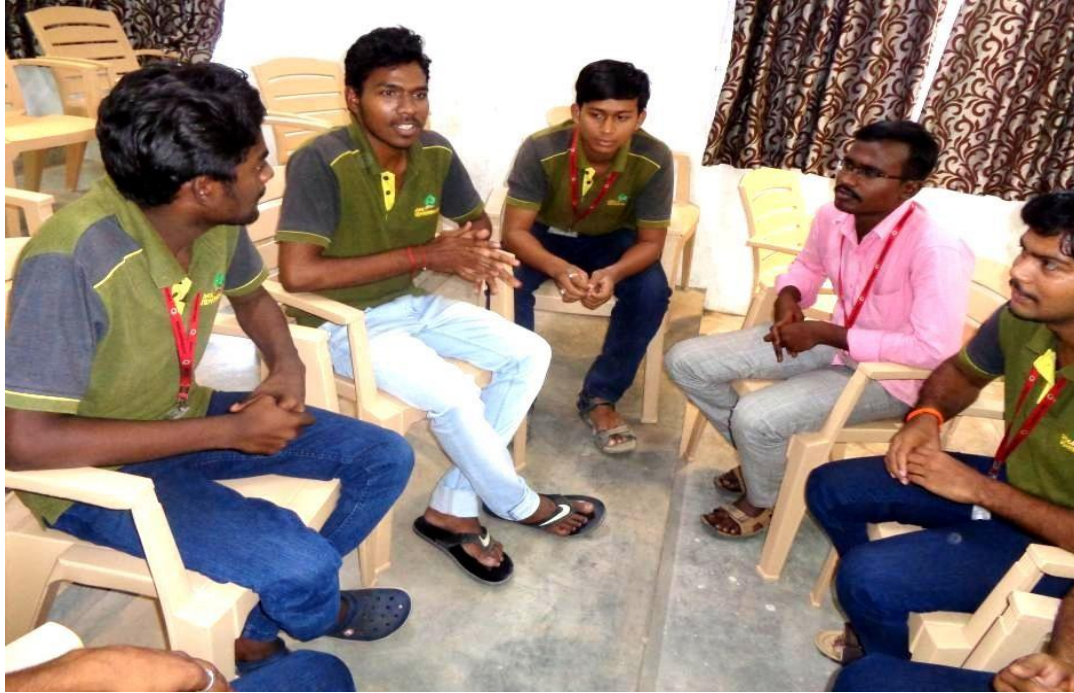
Group Discussion on "Reservation System of India"