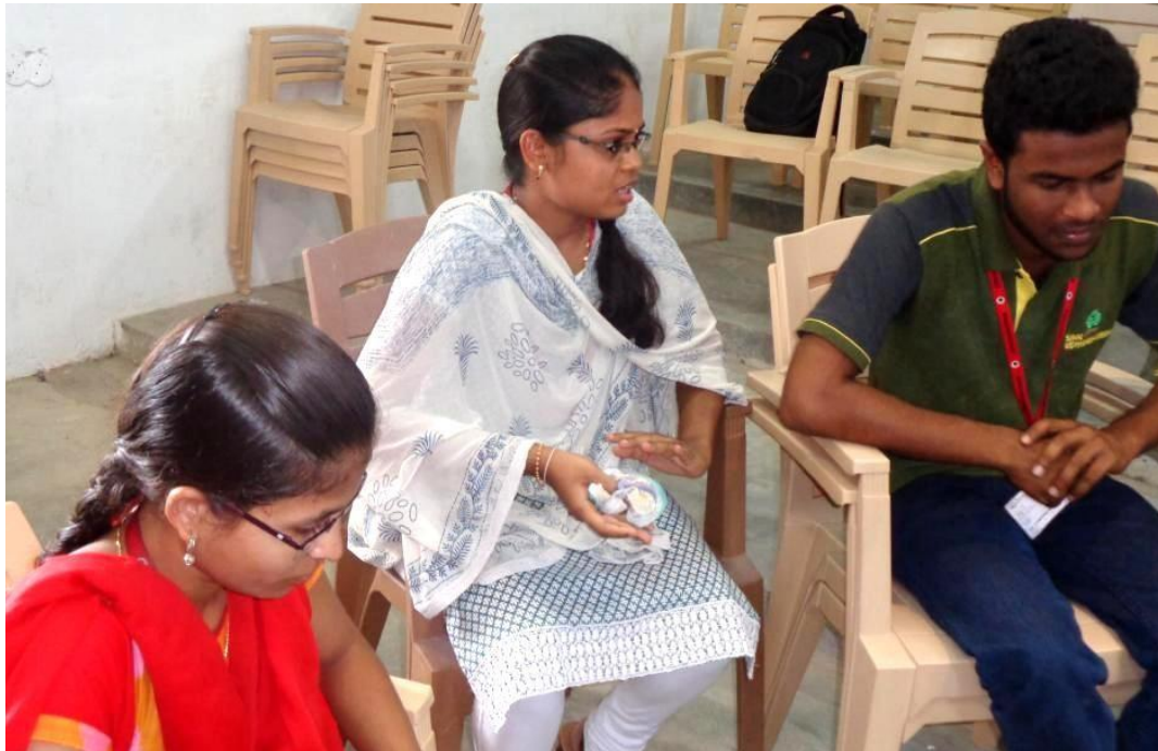
Group Discussion on "Importance of Vote and Individual Responsibility"