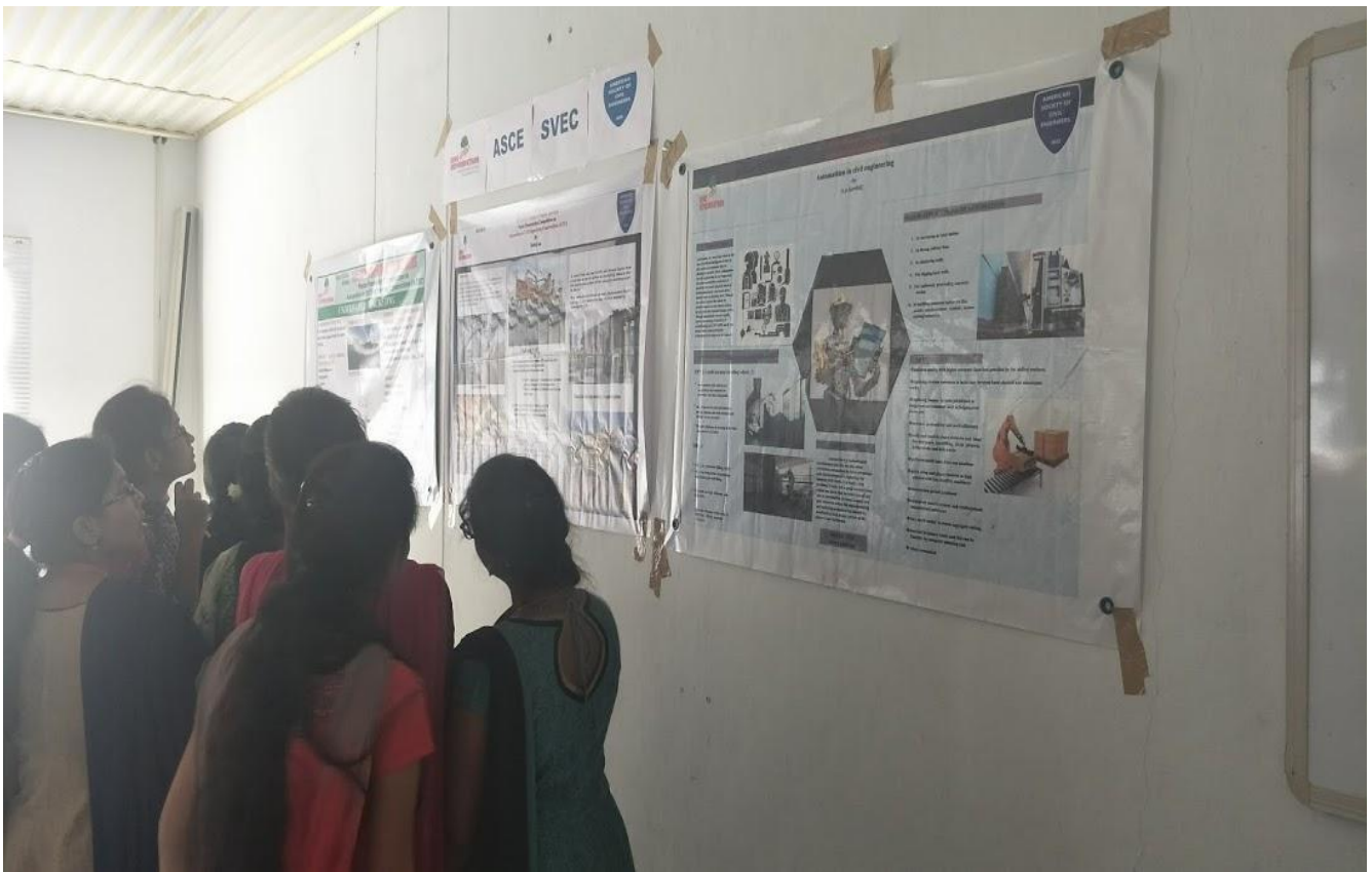
Students Observing the Posters