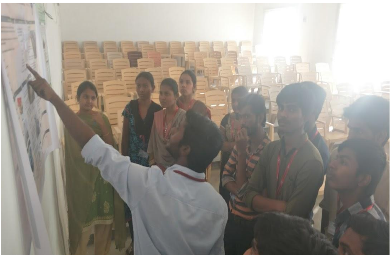
Students Listening to the Poster Presentation