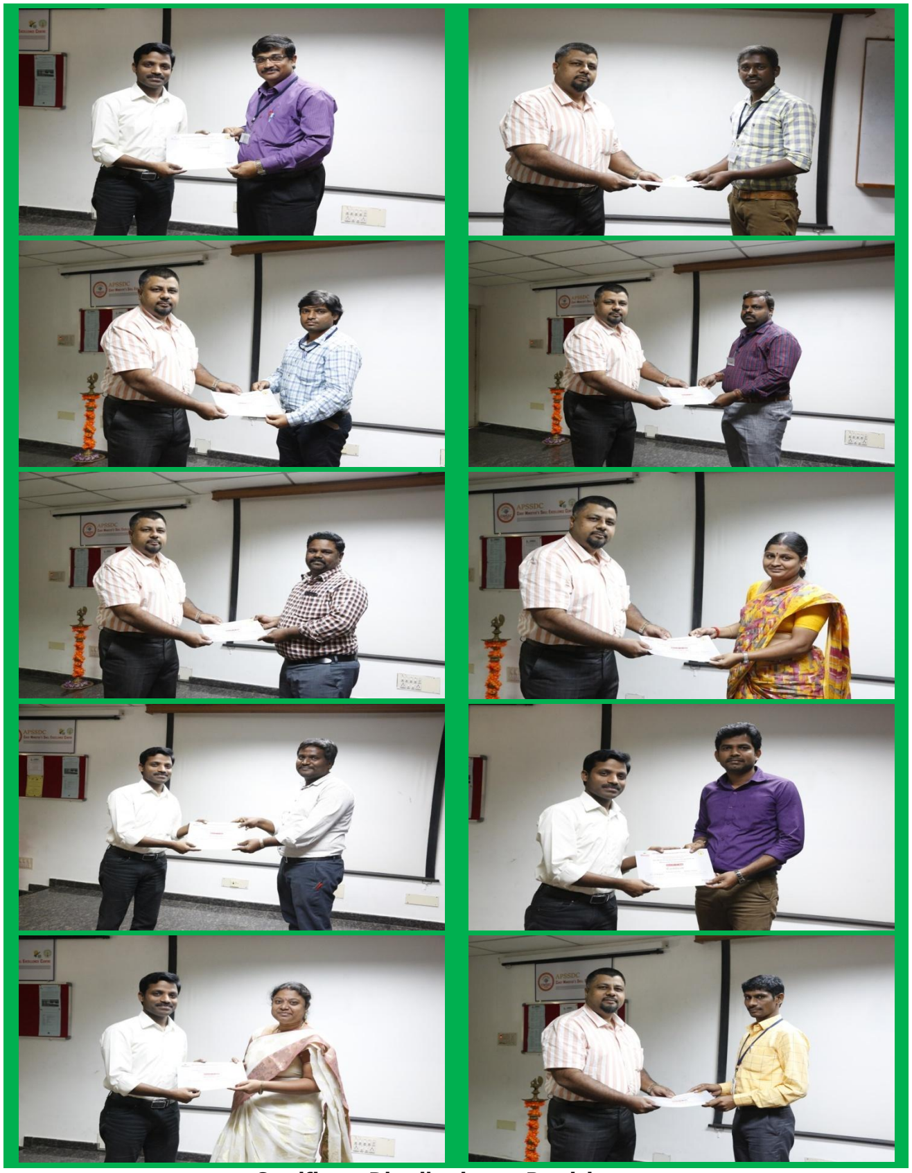
Certificate Distribution to Participants.