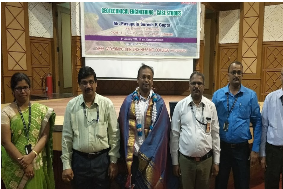
Felicitaton to the Guest Speaker