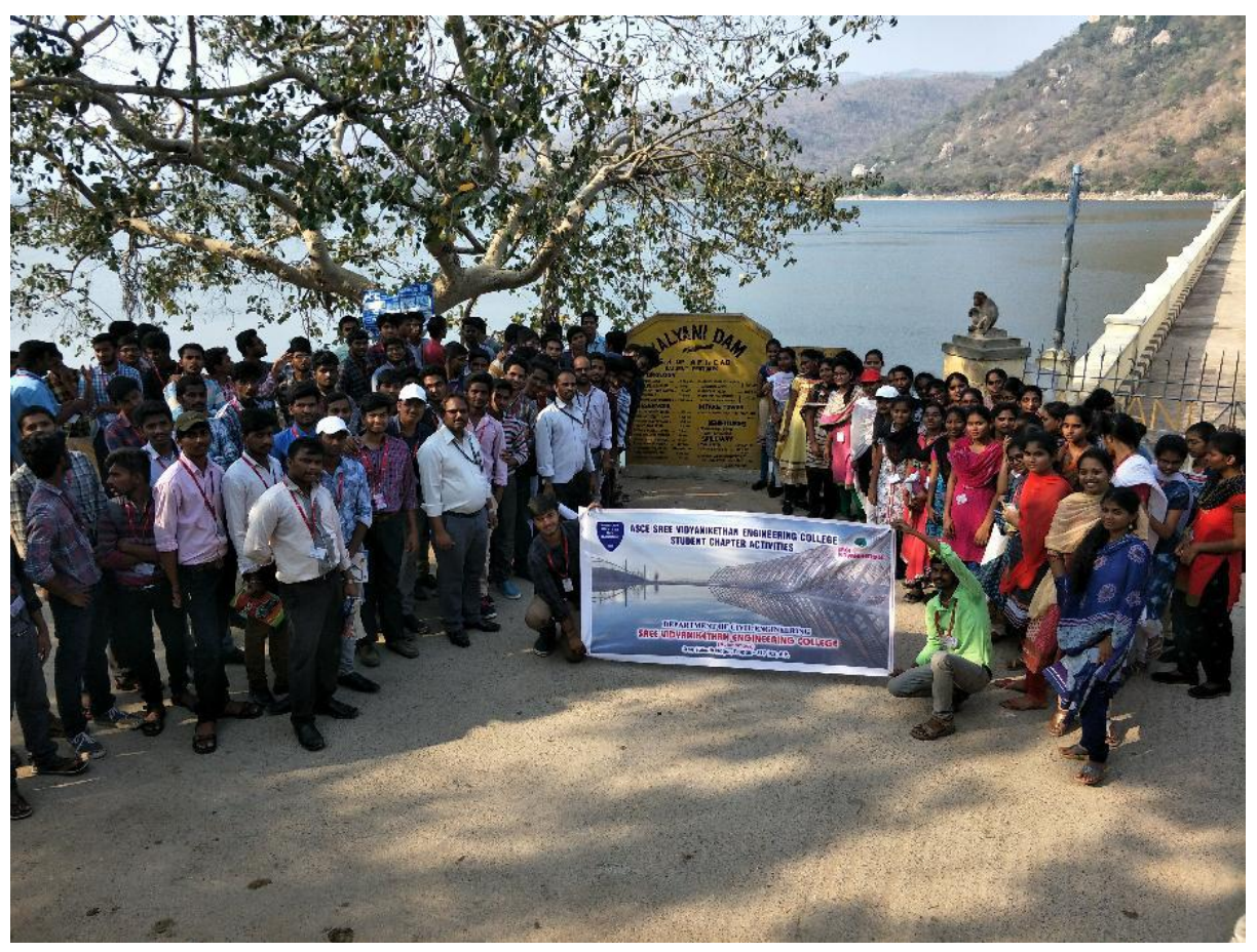
II B.Tech. II Sem. CE Students at the Field Visit to Kalyani Dam, A. Rangampet.