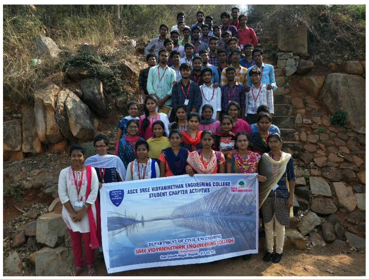
II B.Tech. II Sem. CE A-Section Students at the Field Visit to Kalyani Dam, A. Rangampet.