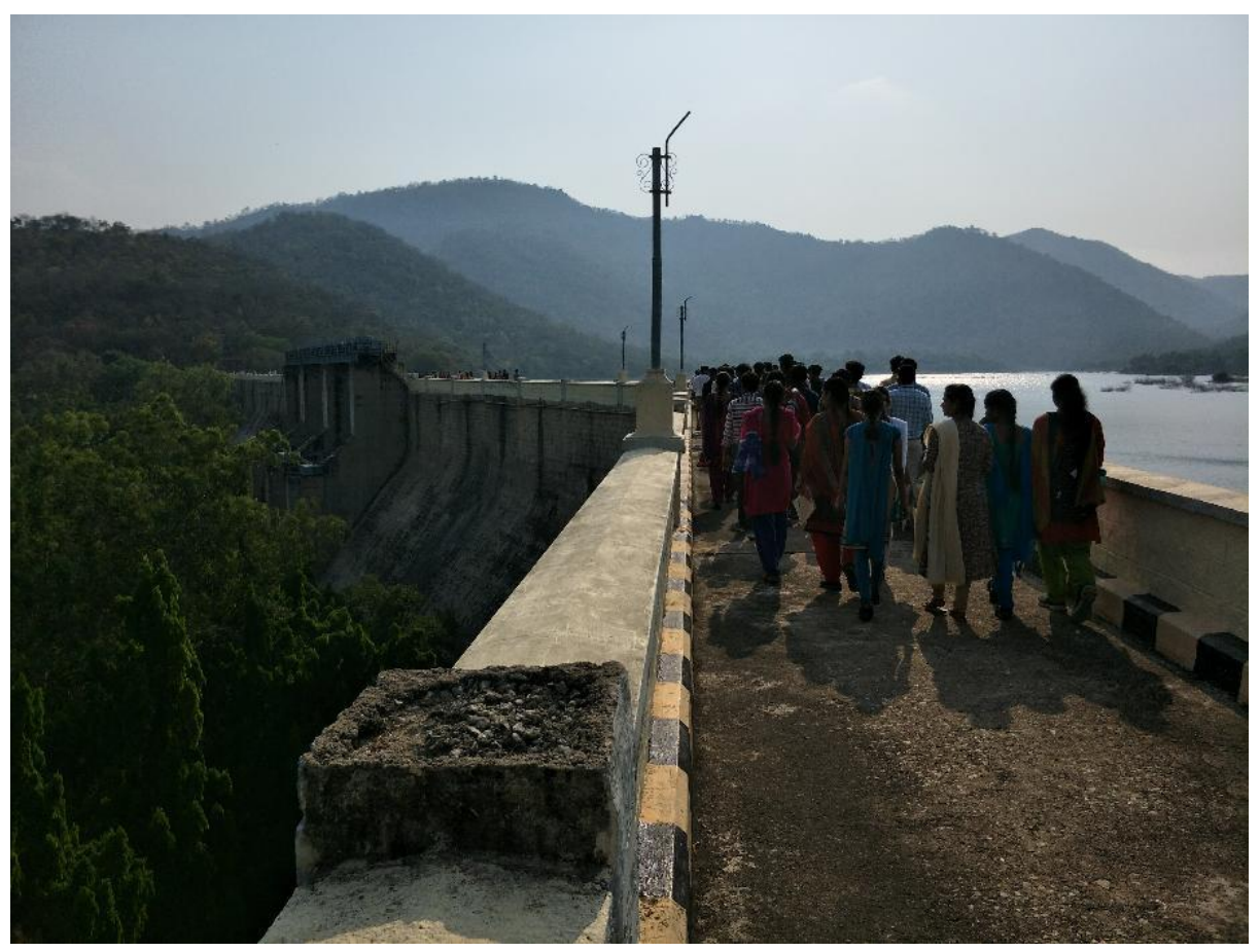
Students at the Field Visit to Kalyani Dam, A. Rangampet.