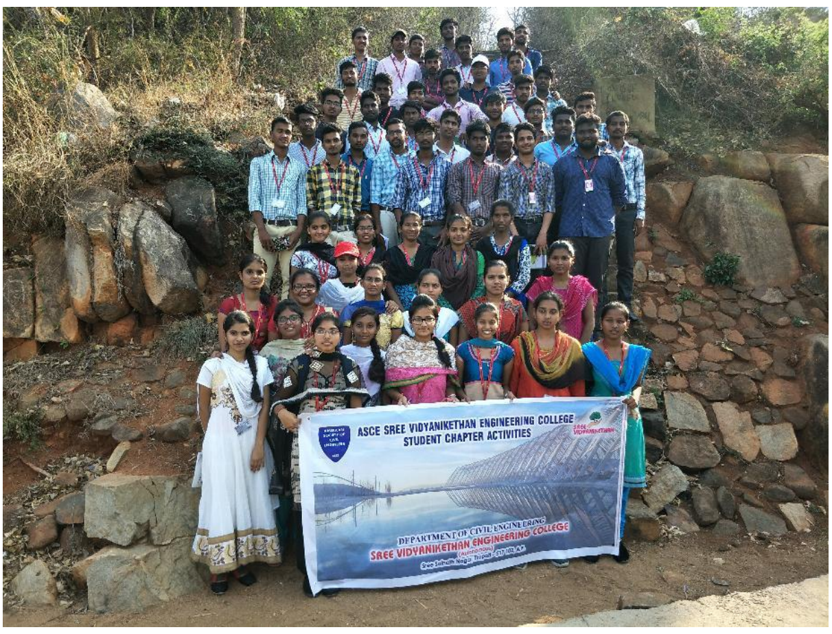
II B.Tech. II Sem. CE B-Section Students at the Field Visit to Kalyani Dam, A. Rangampet.