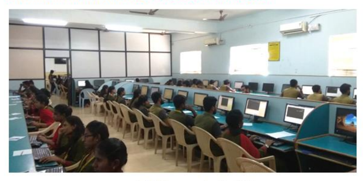
Lab7: Programming In C Lab