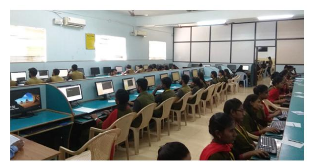
Lab1: Computer Networks Lab