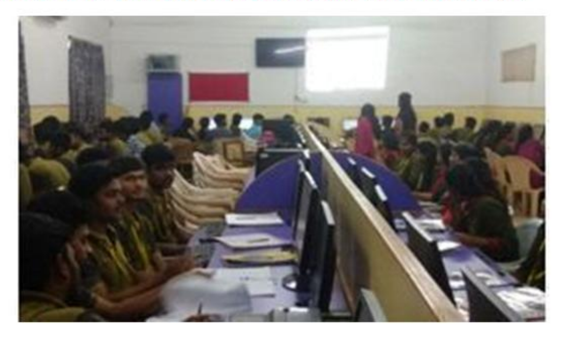
Lab3: Database Management Systems Lab