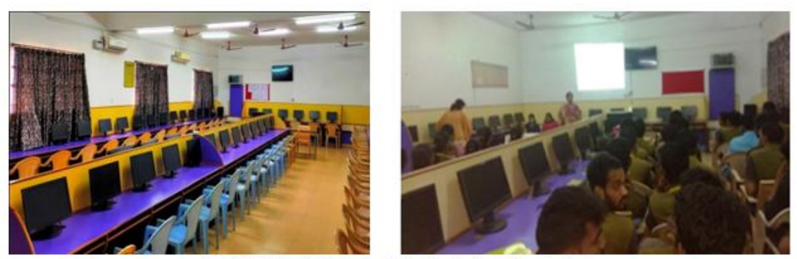
Lab6: Object Oriented Analysis And DesignLab