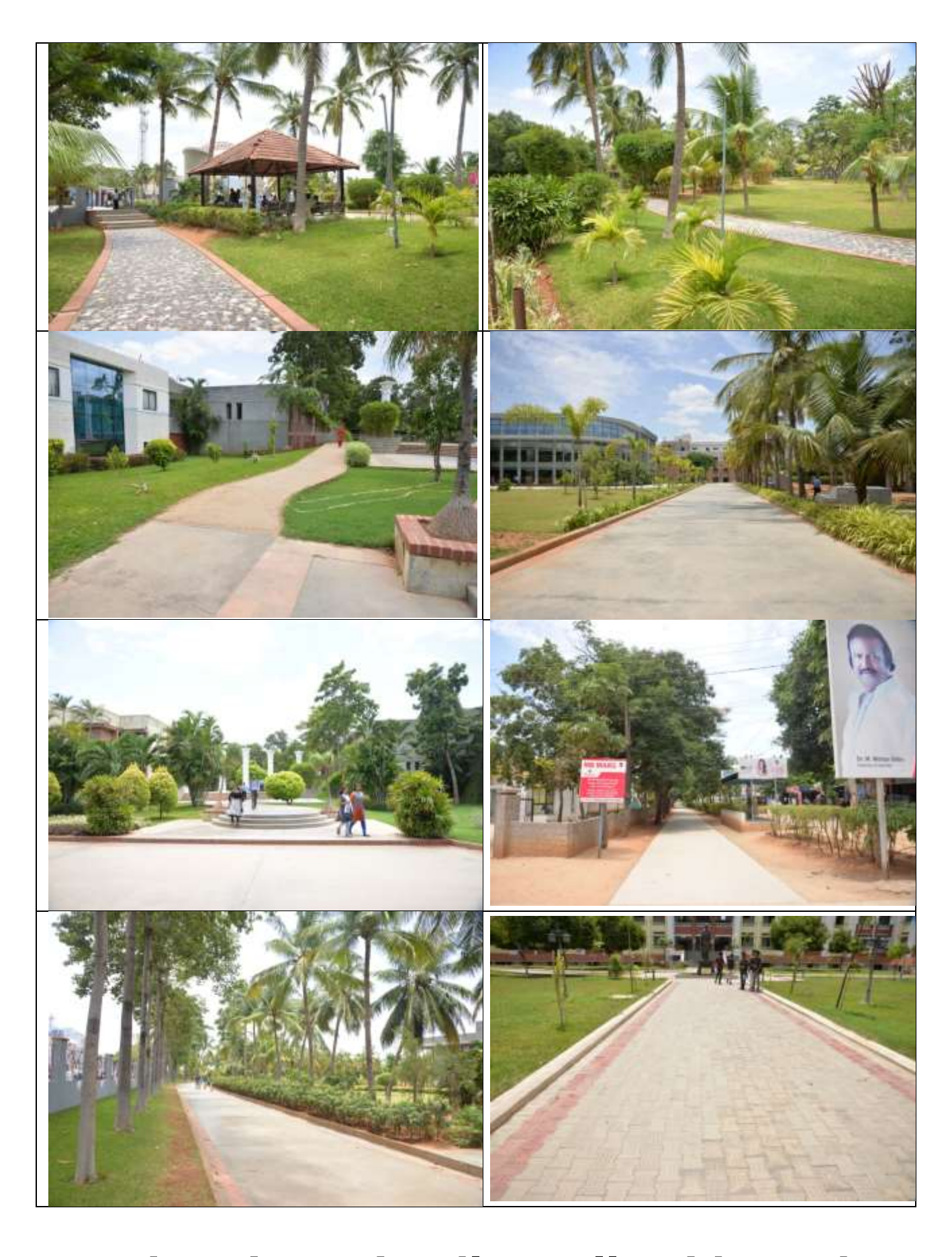
Pedestrian Friendly Well Laid Roads