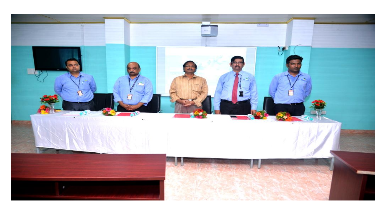
Chief Guest, Convener and Other Dignitaries in Inaugural Function