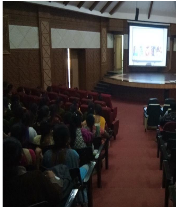
Students & Faculty participating in the Sessions