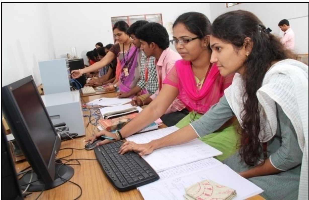
Industrial Automation Lab