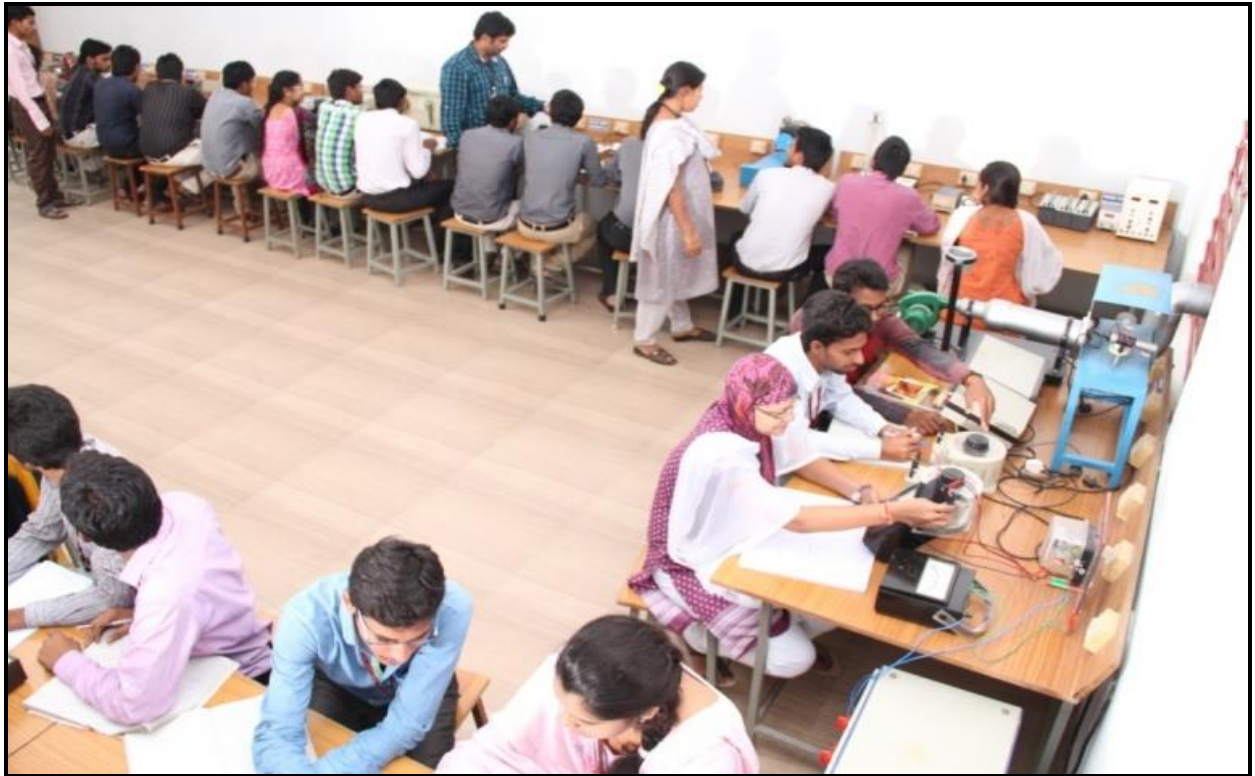
Measurements and Transducers Lab