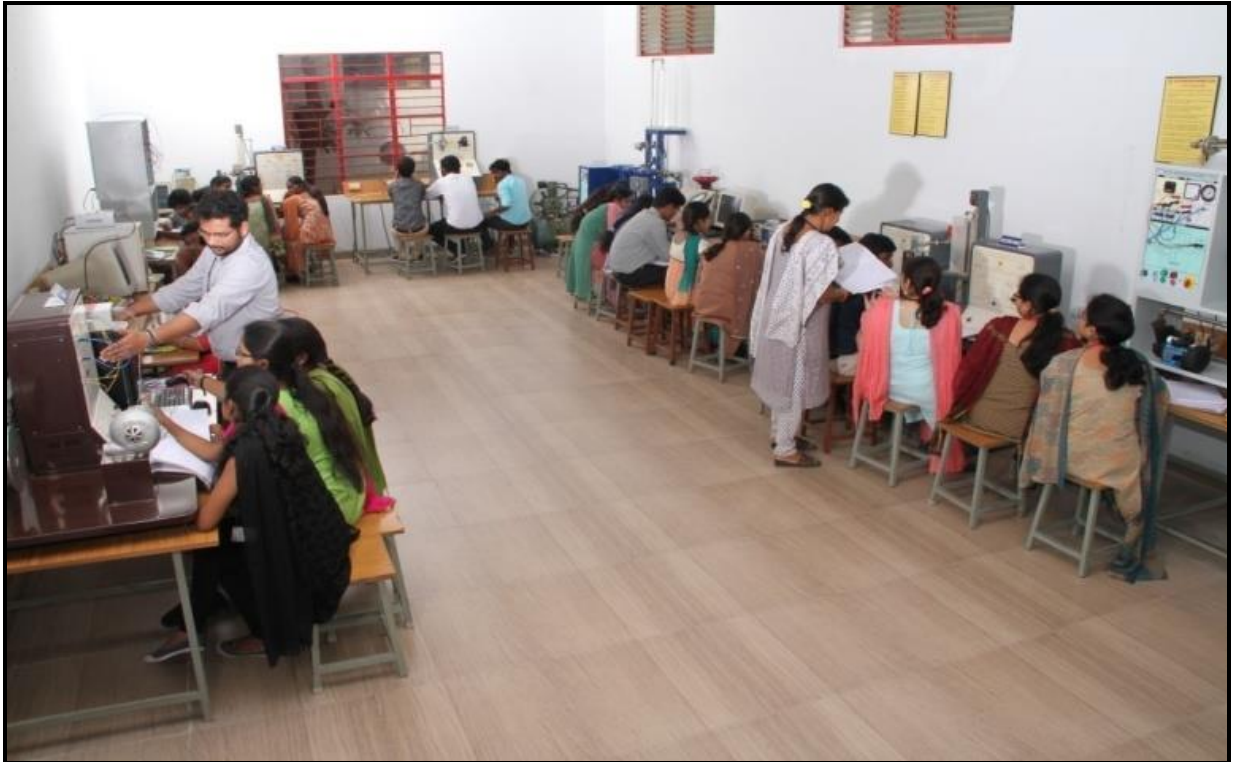
Process Control Lab