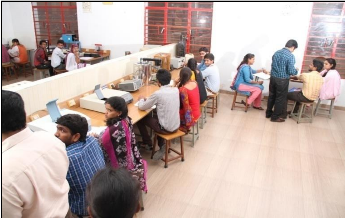
Analytical and Biomedical Instrumentation Lab