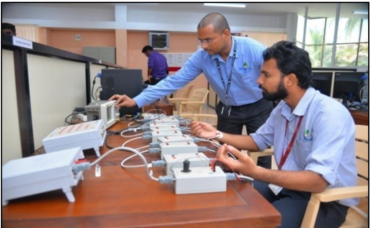
Bio-signal Research Lab