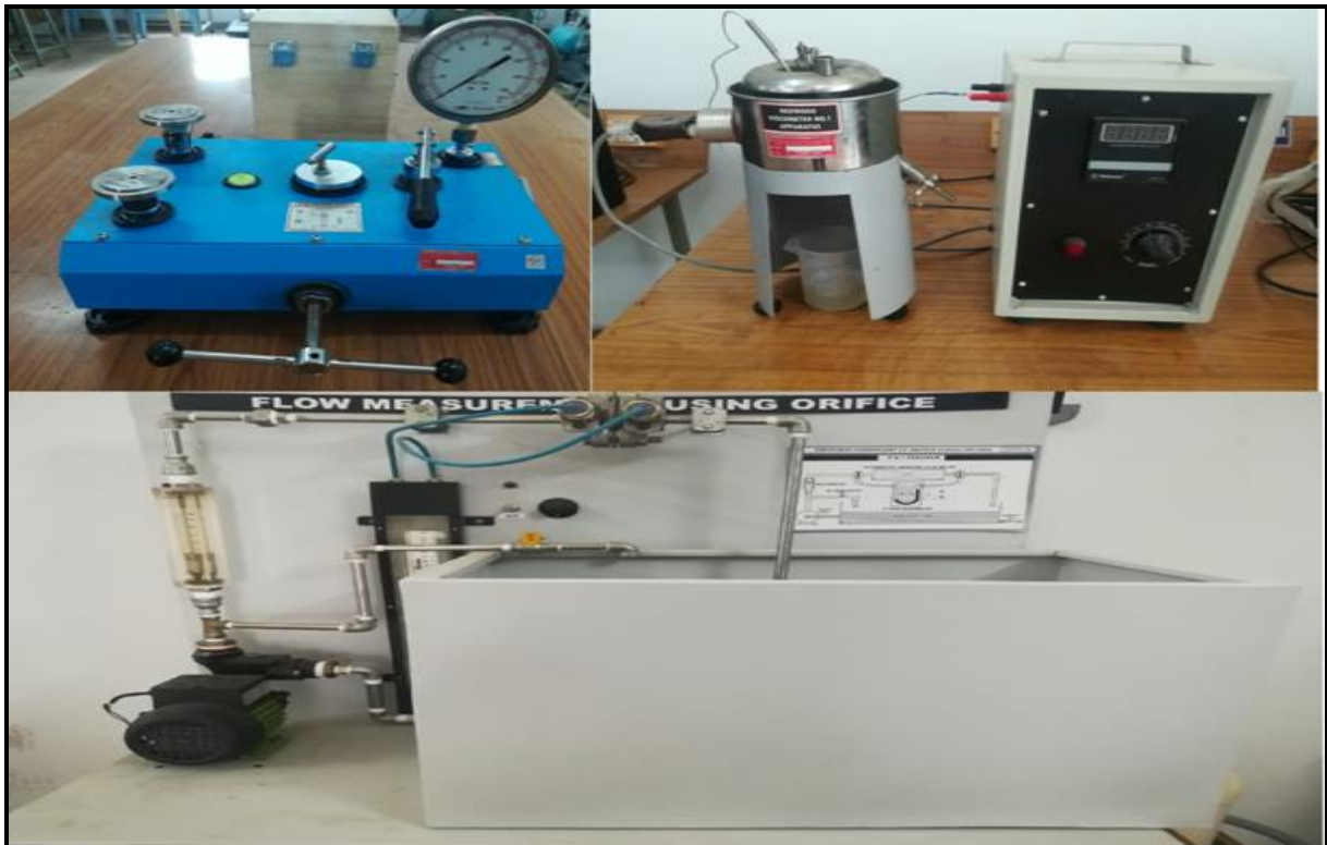
Industrial Instrumentation Lab