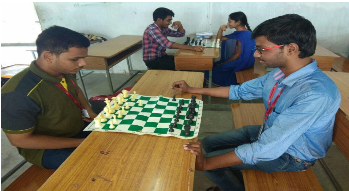
Students at chess

In Addition to above Events additional events like Out Reach Activity on Scope of Instrumentation was organized at two different Venues to create awareness on Instrumentation.