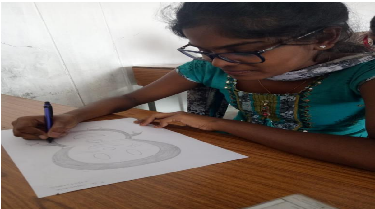
Student at pencil Sketch

Coming to the Extra –Curricular activities we arranged various innovative programs like Pictionary, 4 pic ONE word, chess, Pencil sketch, Lit your brains and Rangoli .