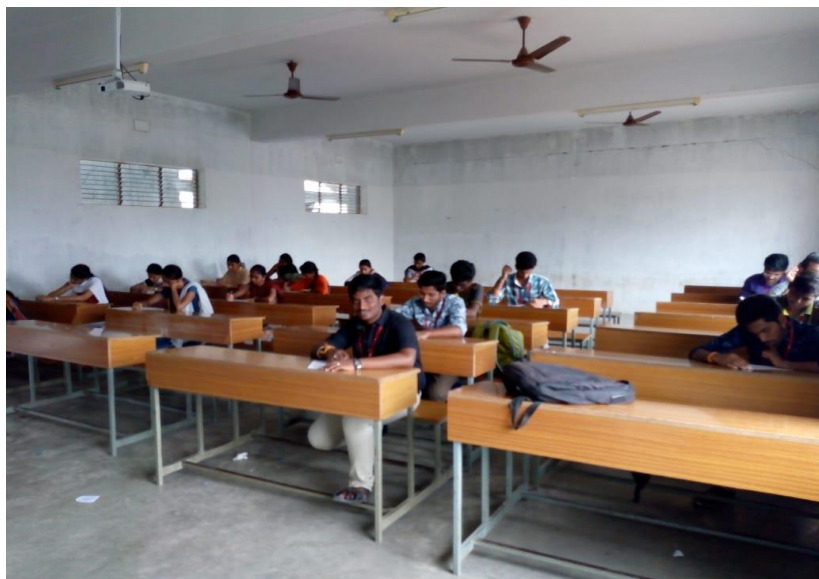
Students at general quiz