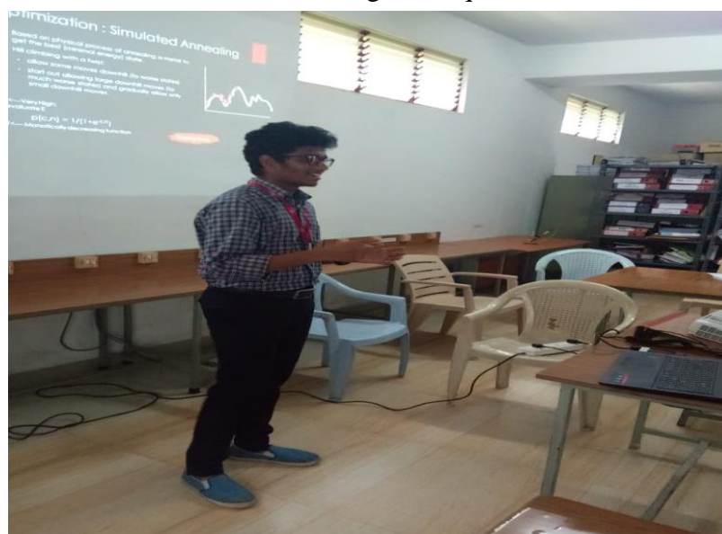
Student at paper presentation