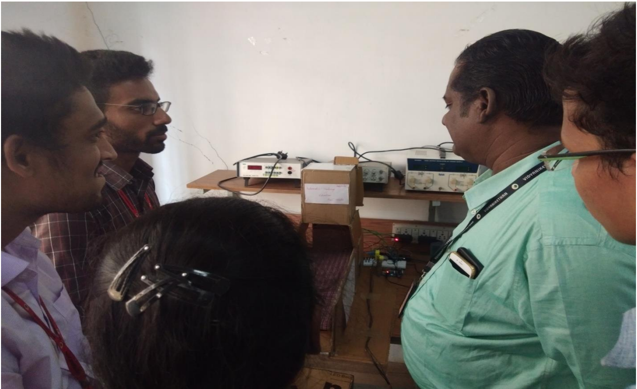
Guest at Circuitrix- Hardware Model Exhibition