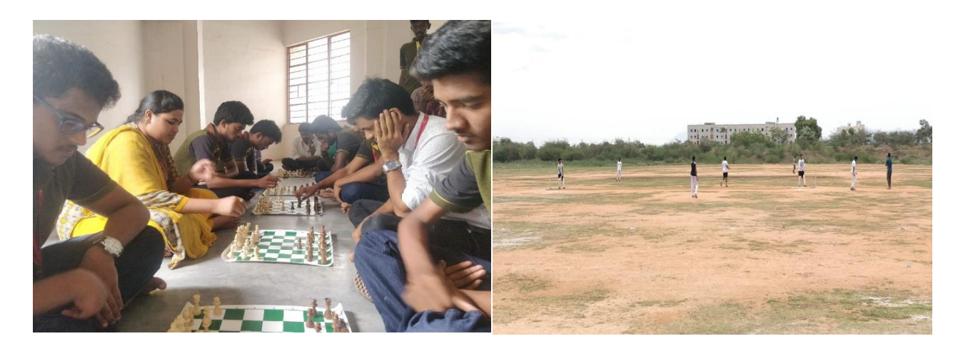
Fig.: Students participated in ACME Games

ACME helps students to strengthen their mental as well as physical capabilities. Keeping this motto in View, ACME Cricket cup for boys and Kho-Kho tournament for girls were conducted. These events gained a good response from students.