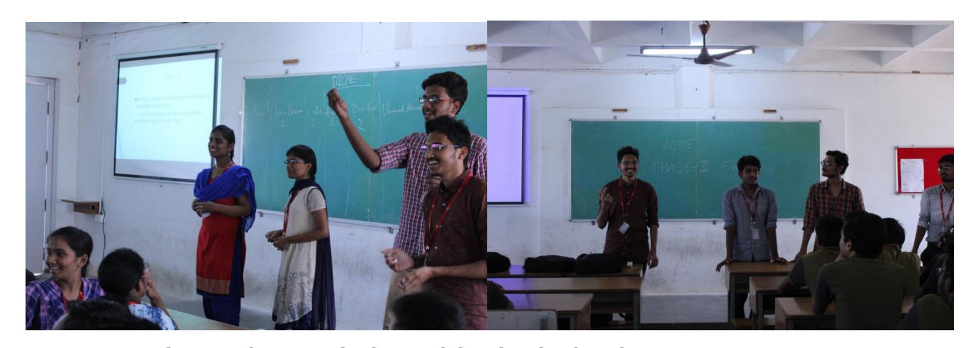
Fig.: Students actively participating in the phase events

All the three phases helped to inculcate Communications skills and Team Leader ship Skills among the students. In turn it helped organizers in improving their organizing skills. These events are conducted every year as a regular practice.