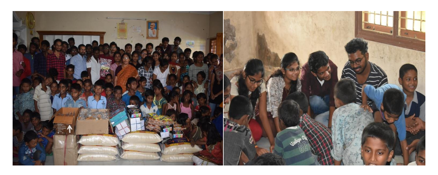
Fig: Students donating Rice and other requirements to Orphanage, playing with kids and educating them about cleanliness.

Another important body to inculcate the attitude of helping the helpless under social initiative is Young Caliber. As a part of this yearly many students of ECE are donating blood to the patients in government hospitals who are in urgency for the blood. This year also, 10 of our students had donated blood. Even, Few utensils and Rice bags were donated to an orphanage – Mathrusya where the abandoned kids are taken care.