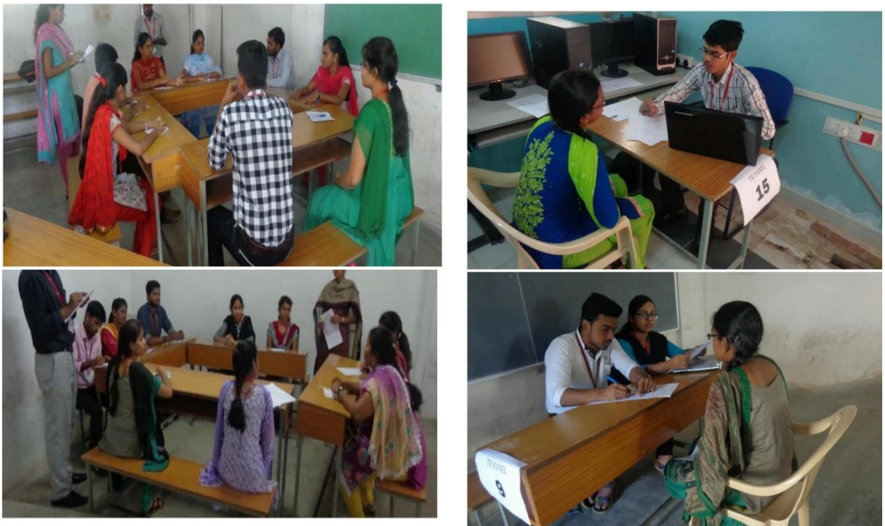
Fig.: Students participating in Placement Activates (Group Discussion and Mock Interviews)

MOCK Interviews and Group Discussions will be conducted every year by ACME to prepare the students for placements. This in turn decreases the pressure among the students during placement activities.