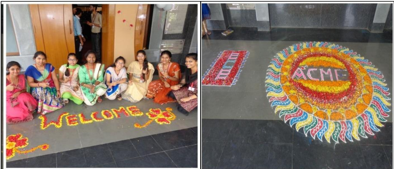
Fig.: Students decorating Dasari Auditorium for ACME Activities

The student technical association of Department of ECE, ACME (Association of Communication Majors and Enthusiasts) holds the responsibility in inculcating values and skills among the students by conducting various technical and non technical events. This year, an overall of 19 events were conducted in three phases. A total of 1670 students were participated and 132 students bagged prizes.