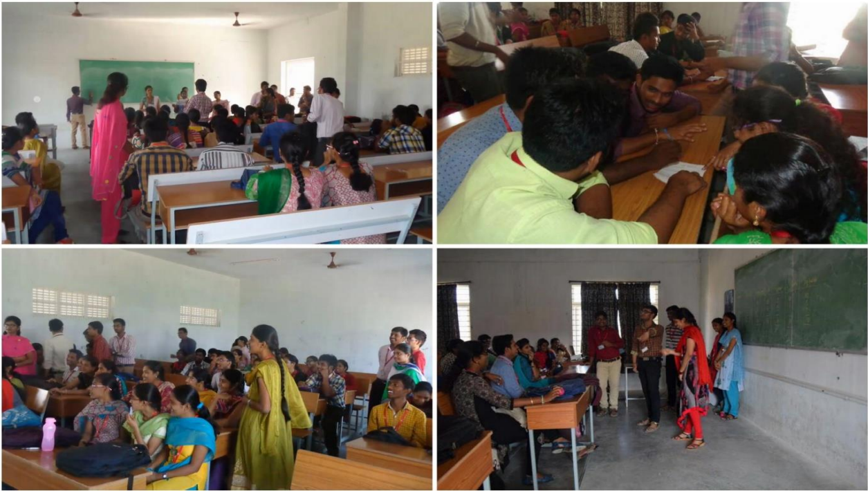
Fig: Students actively participating in the phase events

MOCK Interviews and Group Discussions will be conducted every year by ACME to prepare the students for placements. This in turn decreases the pressure among the students during placement activities.