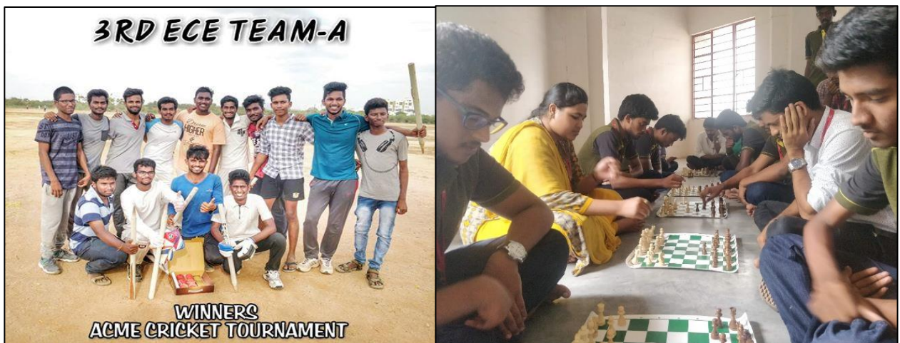
Fig.: ACME Cricket Cup Winners.

ACME helps students to strengthen their mental as well as physical capabilities. Keeping this motto in View, ACME Cricket cup and Chess tournament were conducted. These events gained a good response from students.