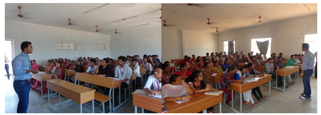
Fig.: Students listening to the lecture delivered by Resource Person

Like previous academic years, this year also ACME events were conducted in three phases helped to inculcate Communications skills and Team Leader ship Skills among the students. In turn it helped organizers in improving their organizing skills. These events are conducted every year as a regular practice.