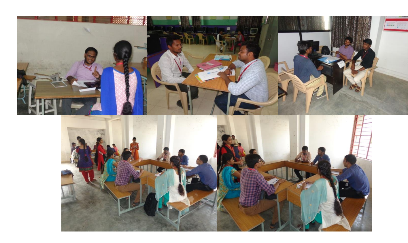
Fig.: Students participating in Mock Placement activity