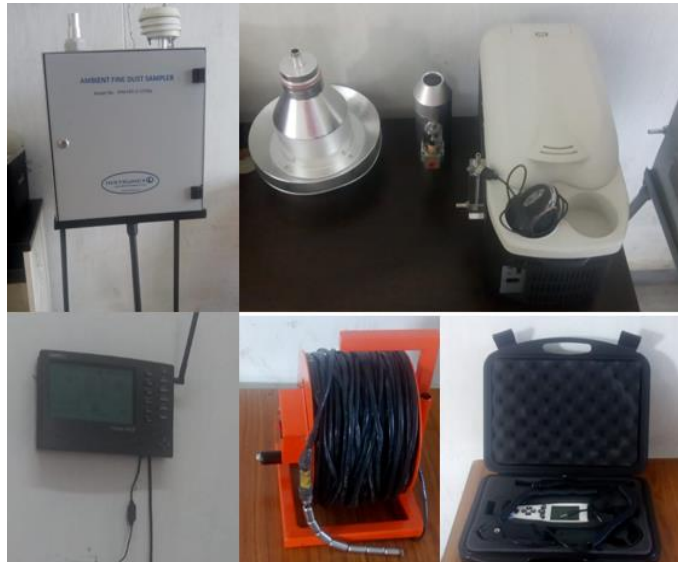
Water and Environment Research Centre