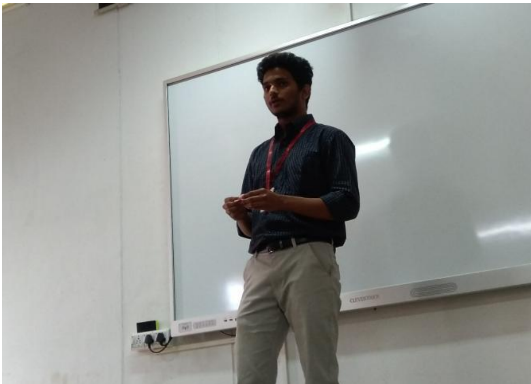
IACE Activity- Just a Minute