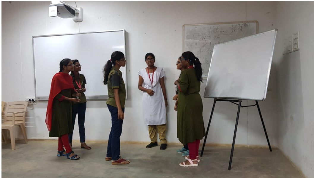
IACE Activities- Techno Marketing