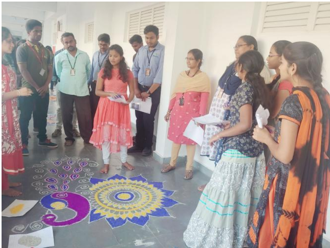
IACE Activities- Rangoli