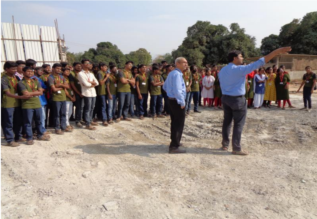
A Field Visit to the Construction Site of College Hostel Building On Sree Vidyanikethan Engineering College Campus