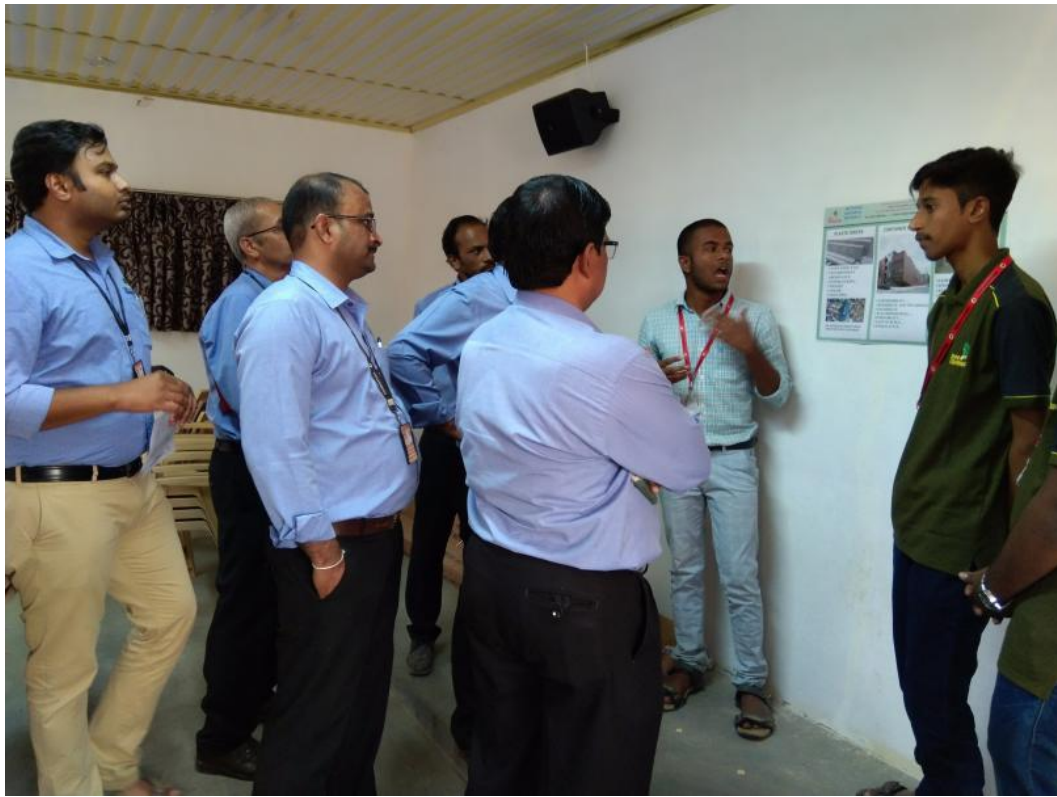
IACE Activity- Poster Presentation