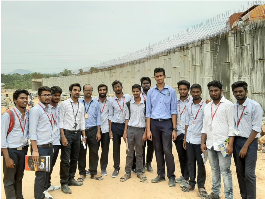
Field Visit to Narasingapuram Railway Over Bridge (RoB) Construction Site conducted by IGS