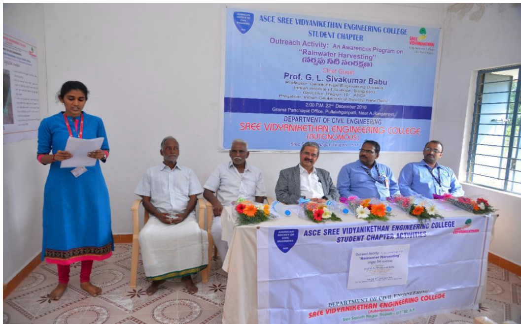
Outreach Activity – An Awareness Program on "Rainwater Harvesting"