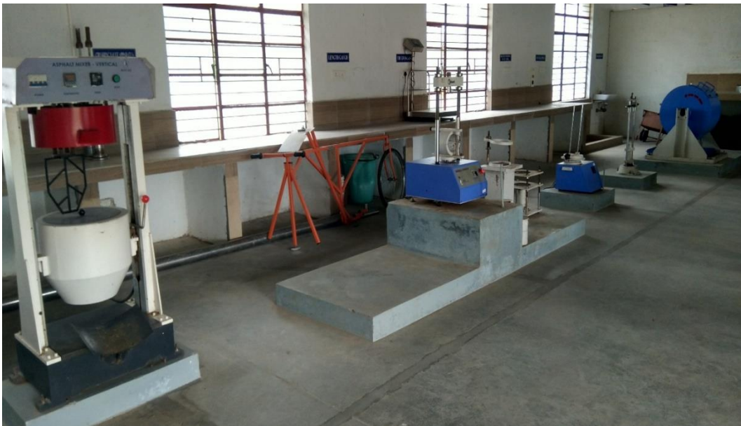
Highway Engineering Lab