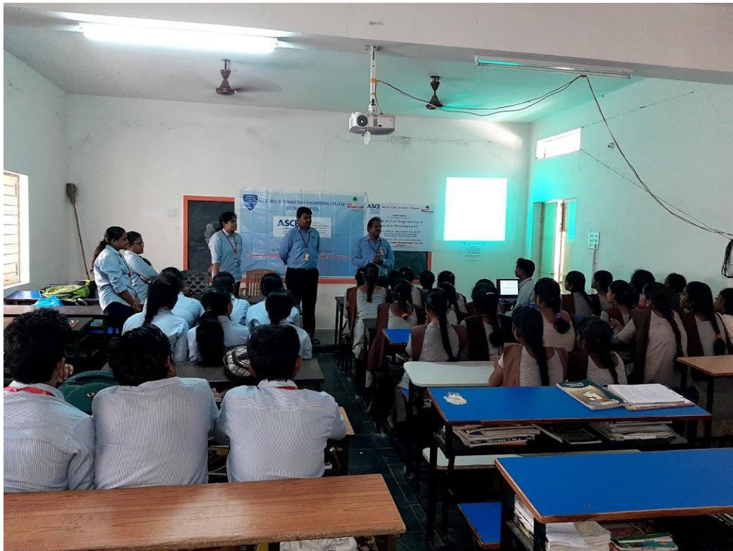
Outreach Activity - An Awareness Program on "Role of Civil Engineering in Societal Development" at Govt. Junior college (Girls), Chandragiri