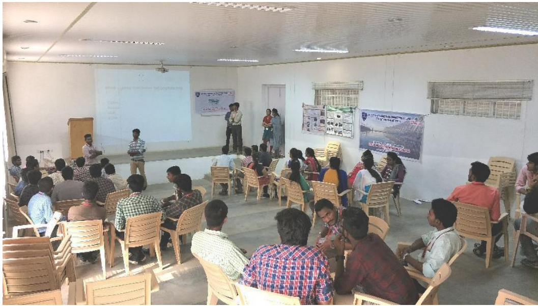
ASCE Activity- Technical Quiz