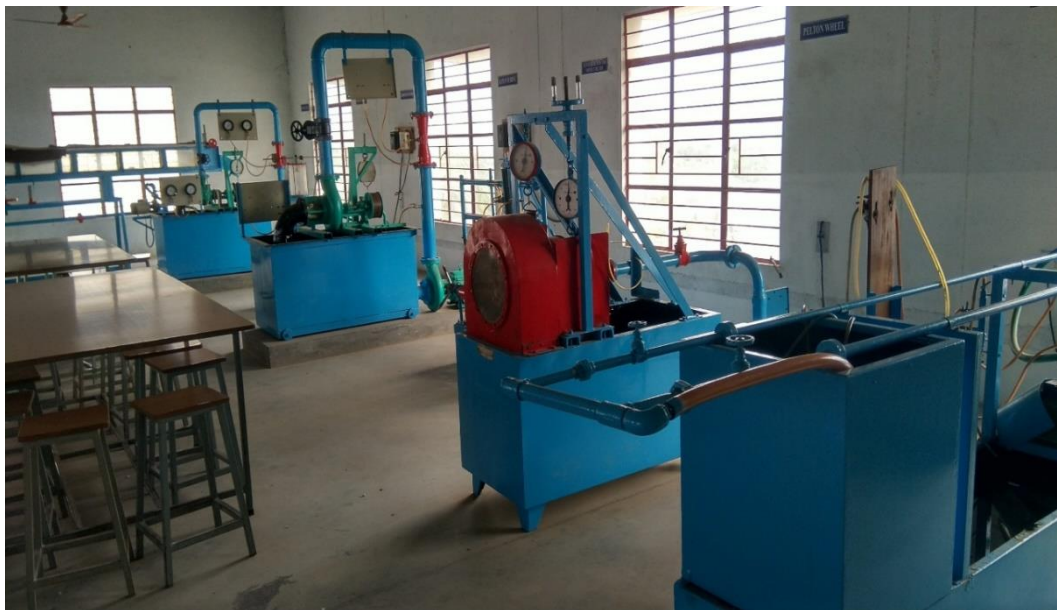
Fluid Mechanics and Hydraulic Machinery Lab