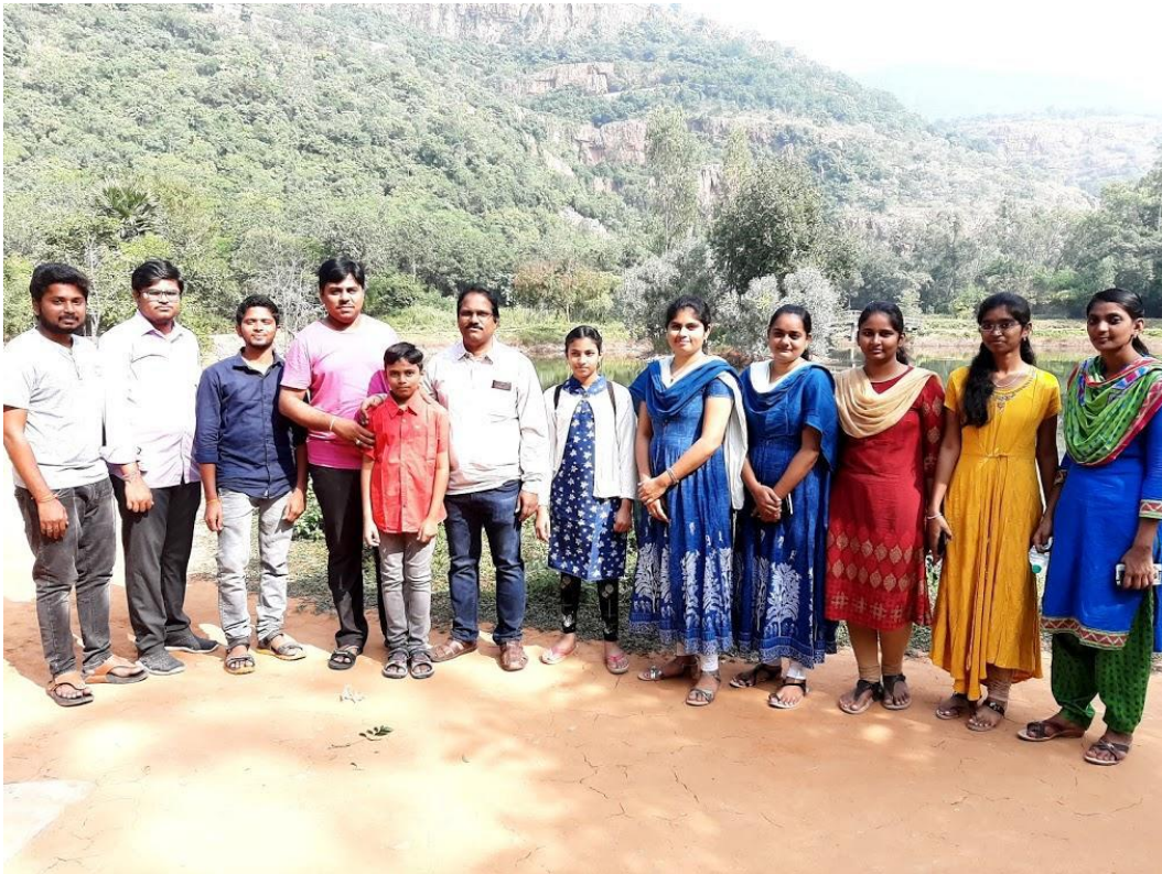
A Group Photo of Faculty Advisor, Coordinator and Office Bearers of ASCE SVEC Student Chapter at the Social Gathering at Divyaramam Park, Tirupati