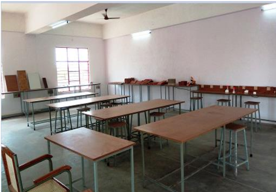
Building Materials and Construction Technology Lab