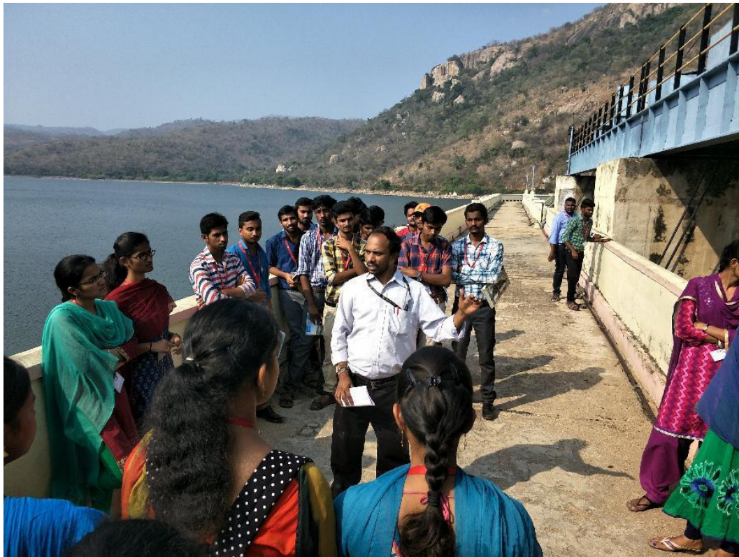
A Field Visit to Kalyani Dam at A. Rangampet