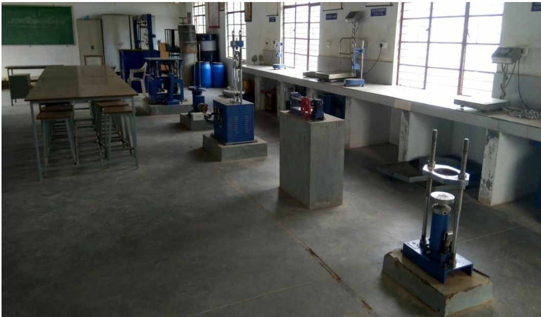
Geotechnical Engineering Lab