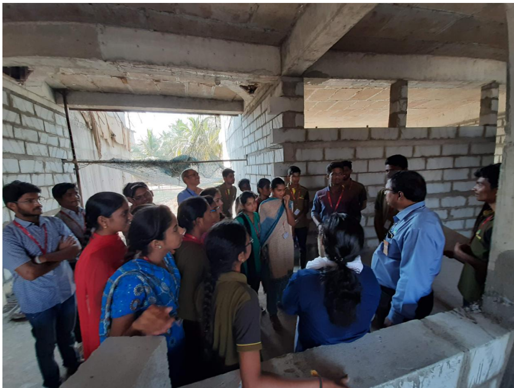
A Field Visit to the Construction Site of New Academic Block G+8 Floors, SVEC Campus