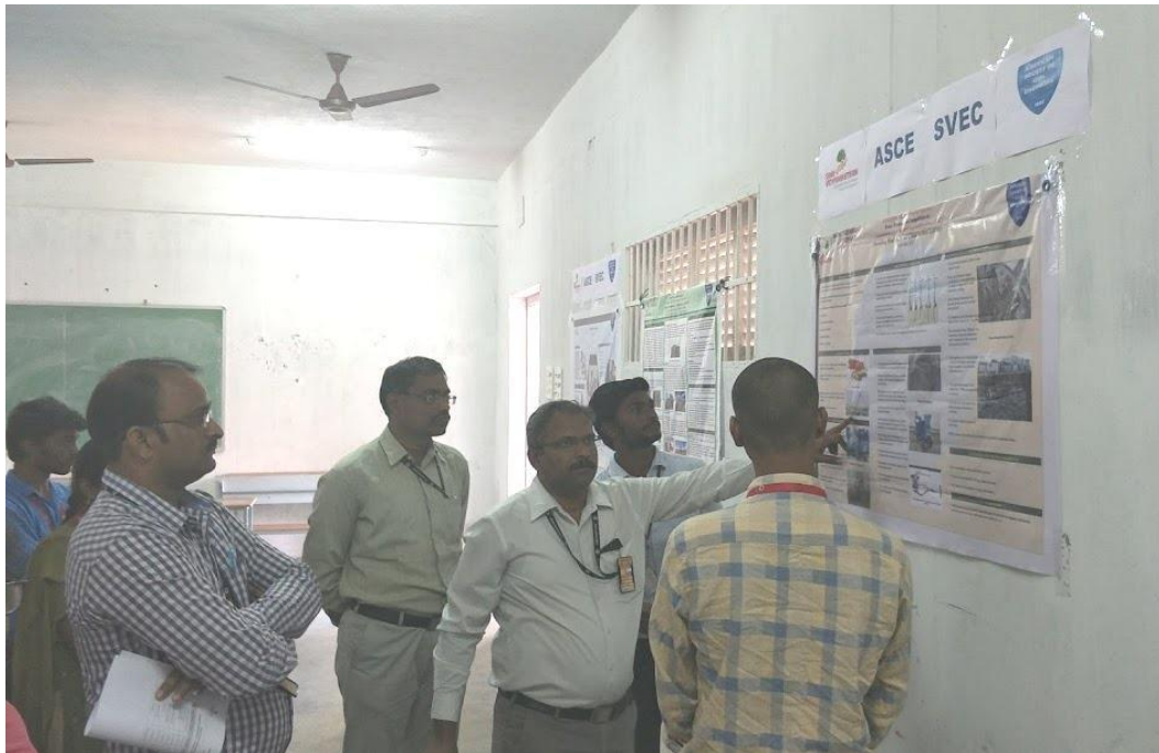
ASCE Activity- Poster Presentation