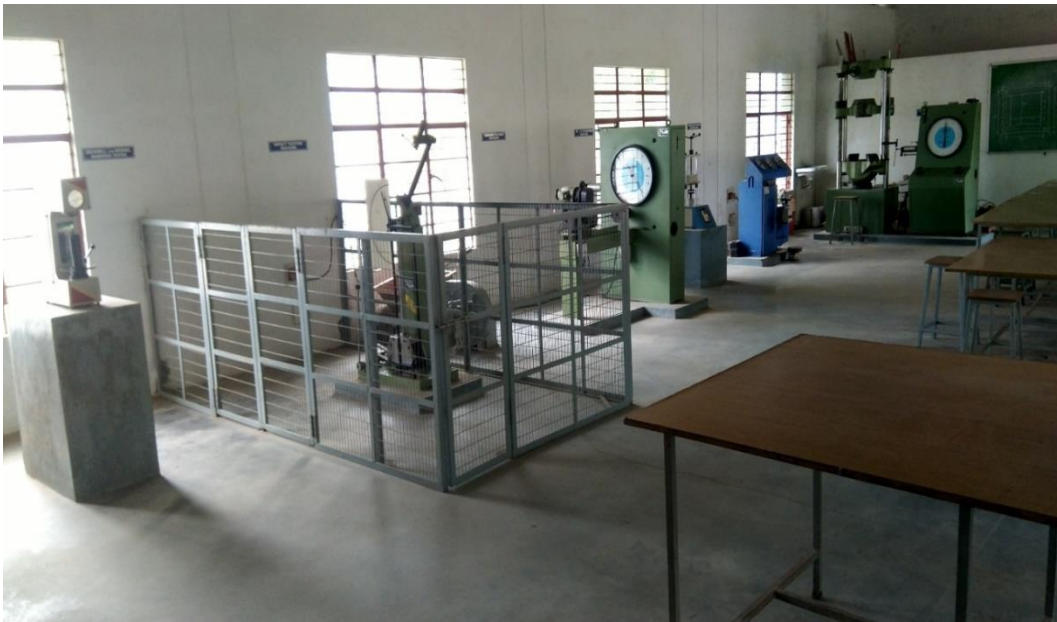
Strength of Materials Lab