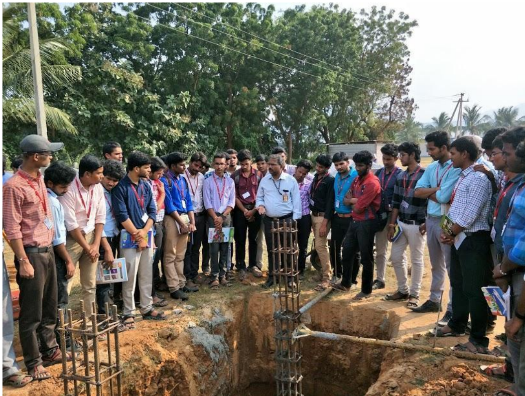
A Field Visit to Construction Sites of Indoor Stadium and Hostel Building at Sree Vidyanikethan Engineering College Campus