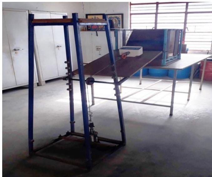
Geotechnical Engineering Research Centre