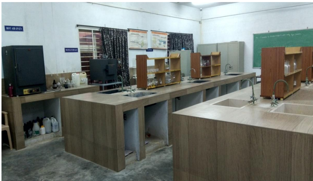
Environmental Engineering Lab