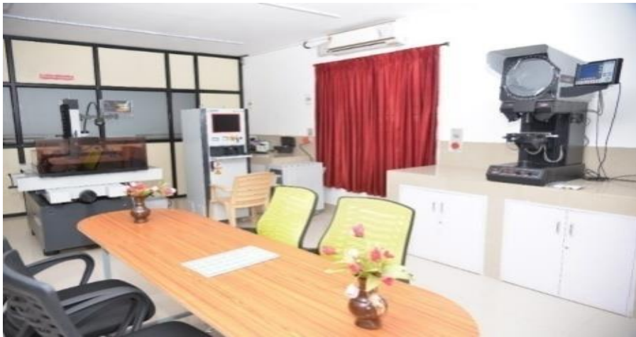
Figure 1: Inside view of Micromachining research center