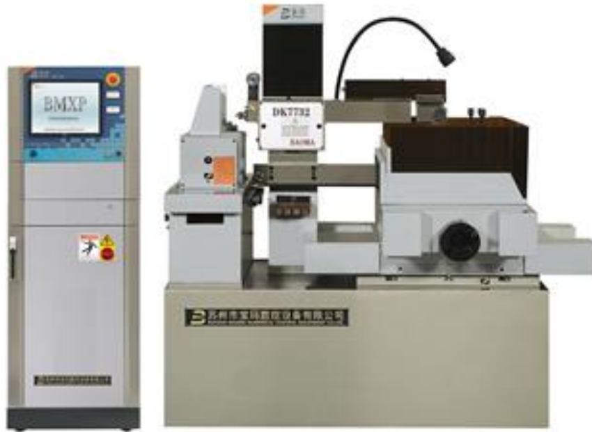
Figure 2: Micro wire EDM