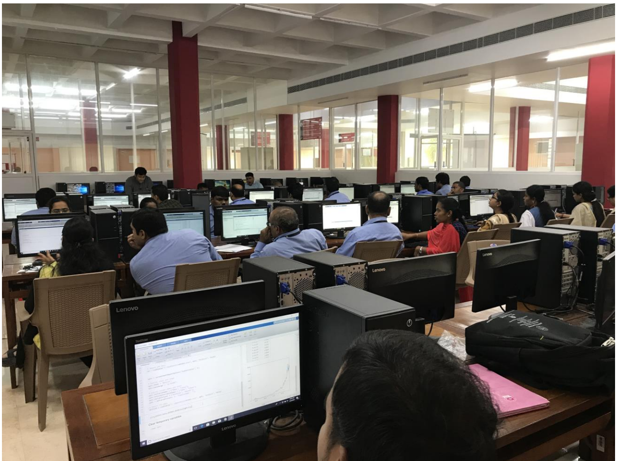
Cross section of participants