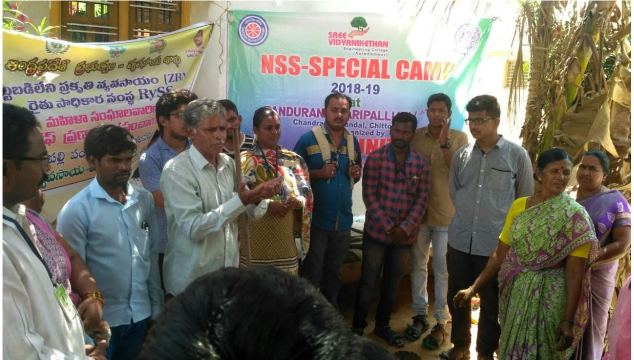
ZBNF –RYSS people demonstrating preparing Vermicompost and village farmers in the event