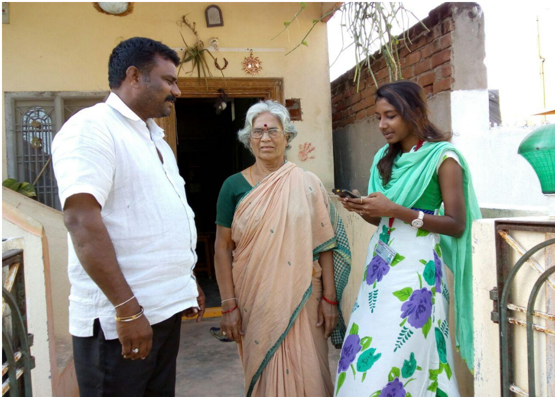
Faculty and volunteers during the survey of ODF KOTALA GP- chandragiri Md.