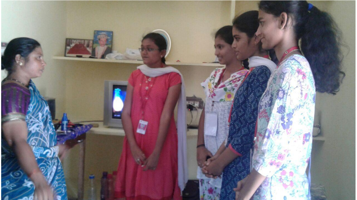
Volunteers interacting with villagers during Door to Door Campaign on Swachh Phakwad