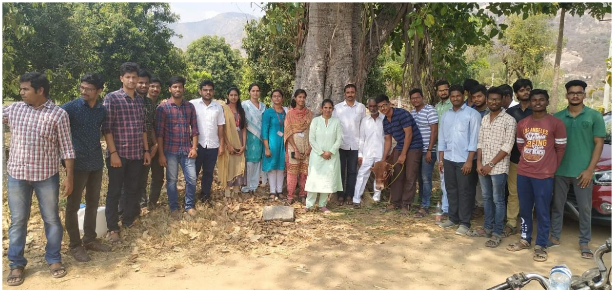
Volunteers along with the C2F team members and villagers