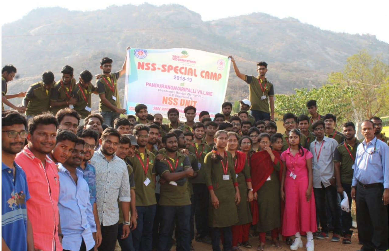
Volunteers along with villagers during valedictory