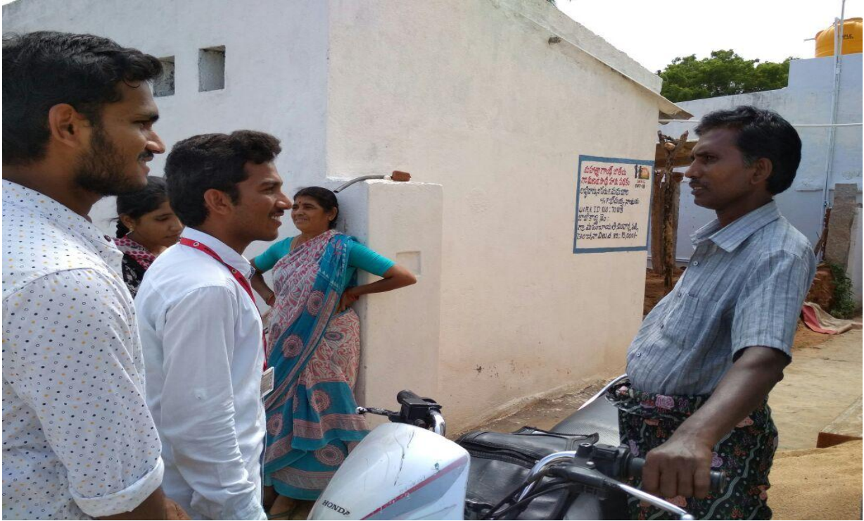
Volunteers Suggesting villagers to take remedial measures for making village open defecation free during Door to Door Campaign .