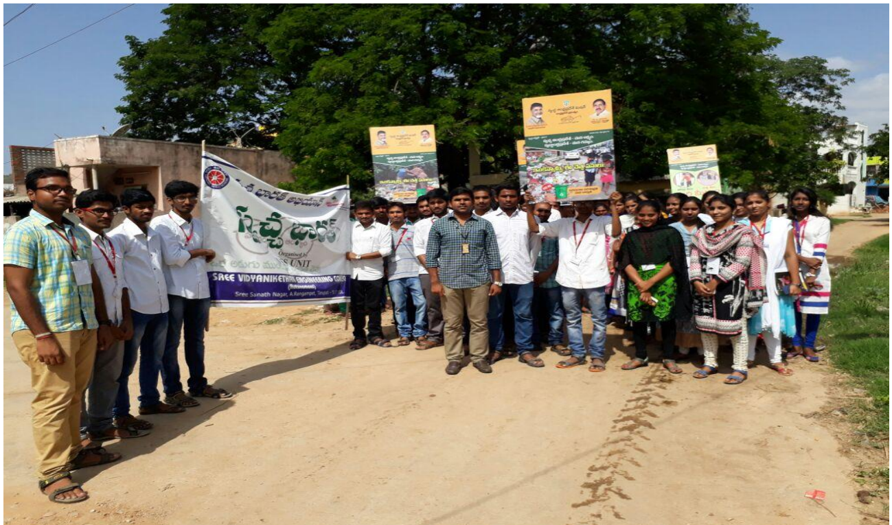
Volunteers Conducted Rally in the adopted village on the theme of Swachh Bharath