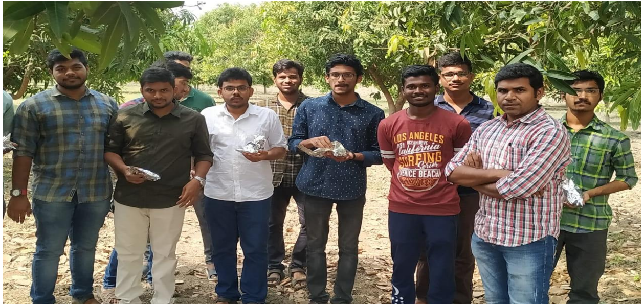
Volunteers having breakfast at farms