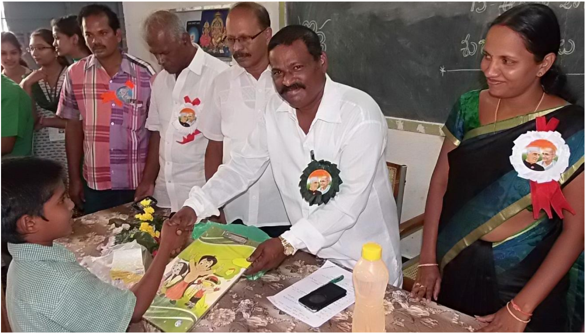
School Principal, Giving away the prizes to the children having best academic performance