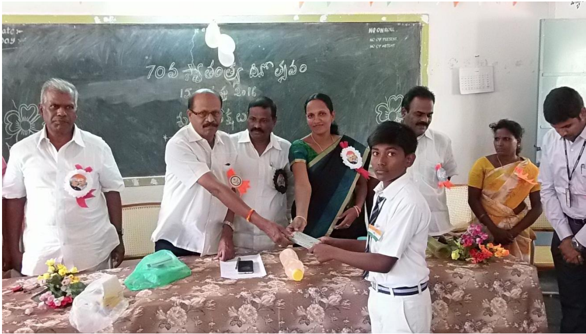
Panchayat Secretary, School Principal and other dignitaries Distributing Prizes to the Students on the occasion of Independence Day