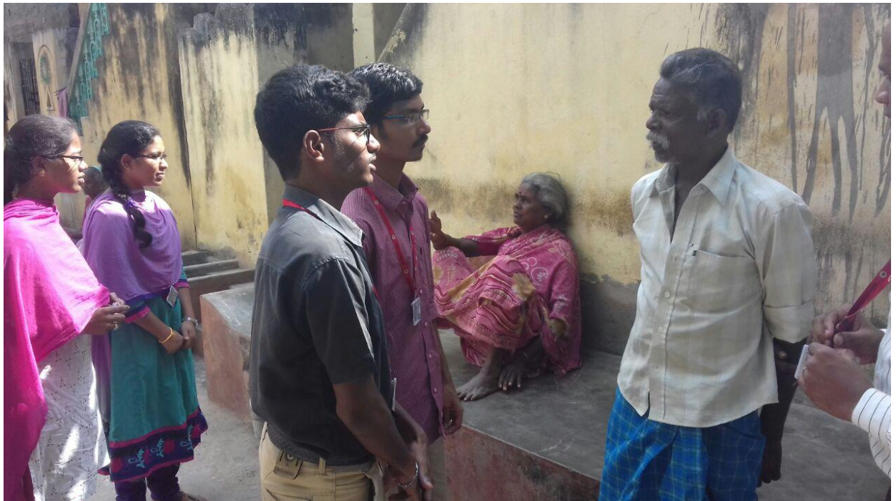
Volunteers interacting with villagers in kotala gramapanchayath