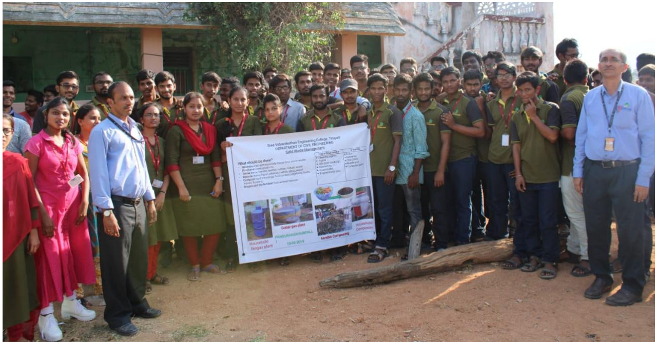
Students with display of posters of rain water hasvesting