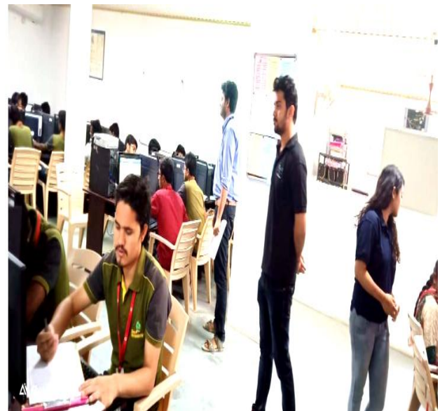
Students giving feedback on Virtual Labs & the workshop