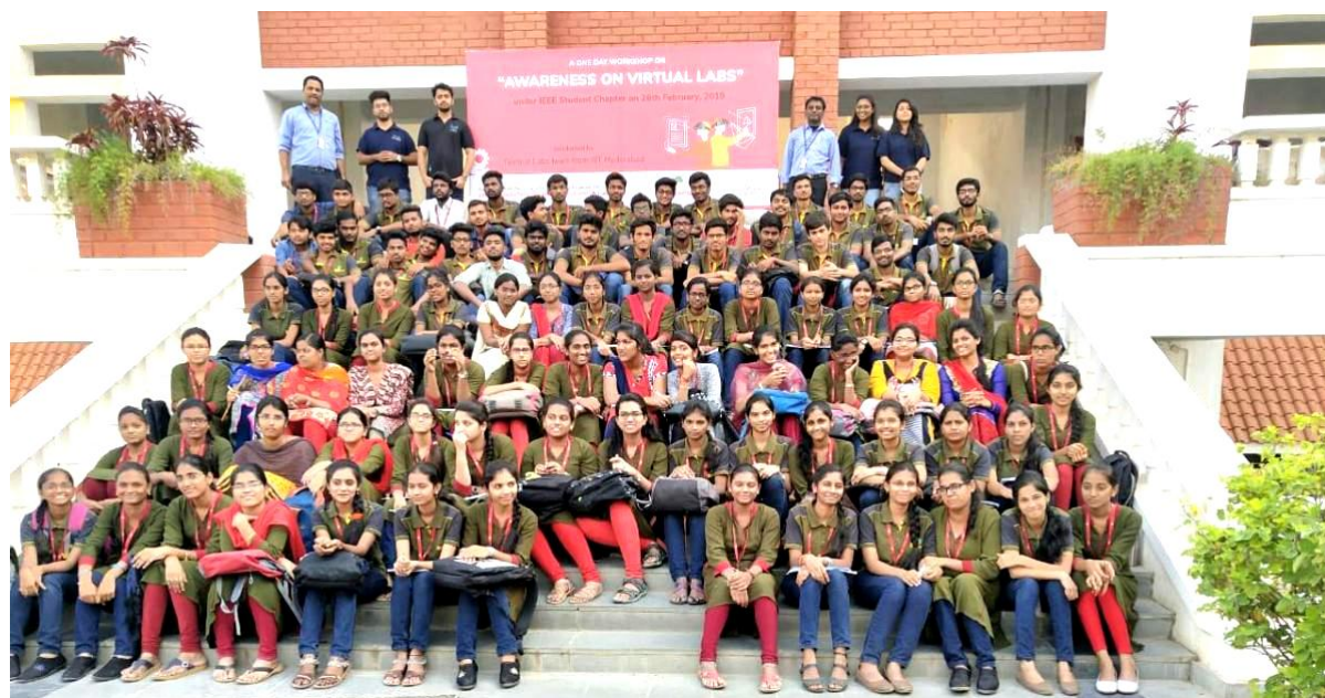
Group photo of participants with Resource persons and organizers

262 students from various disciplines such as EEE, ECE, EIE, CSE, IT, CSSE, ME and CE have registered and participated in the workshop held in two slots i.e., from 11:00 to 1:30 and from 2:30 to 5:00 PM in Room No. 408 of IT Department.