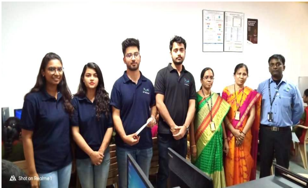
Resource persons (IIIT, Hyderabad) with faculty of SVEC

IEEE Student Chapter of SVEC has organized a workshop on “Virtual Labs” in collaboration with IIIT, Hyderabad on 26 th January, 2019. The objective of this workshop is to make the students and faculty acquaint with the importance and usage of Virtual labs where experiments can be conducted in virtual environment. This was a good opportunity for inquisitive students that provides access to high quality resources and free Internship opportunities.