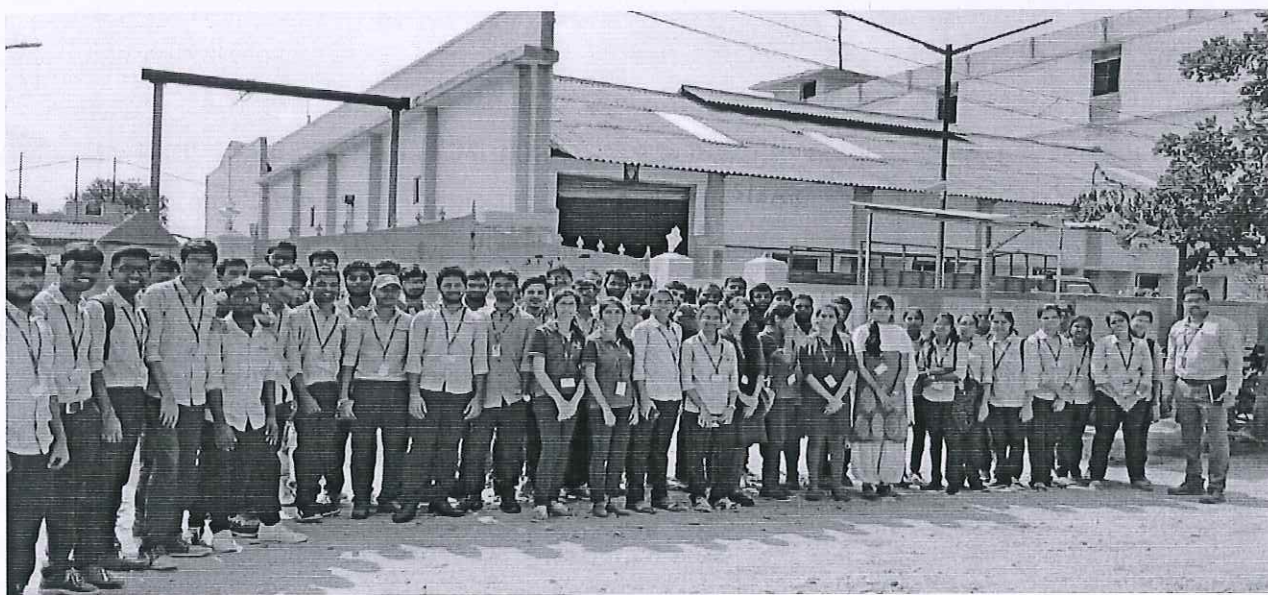
Industrial Visit to SIBAR Autoparts Pvt. Ltd., Renigunta

On Day 3, all the participants visited Sibar Autoparts Pvt. Ltd., Renigunta, as a part of this awareness camp. They experienced various operations like, melting, casting, heat treatment, inspection in the production of automobile parts, decorative items.