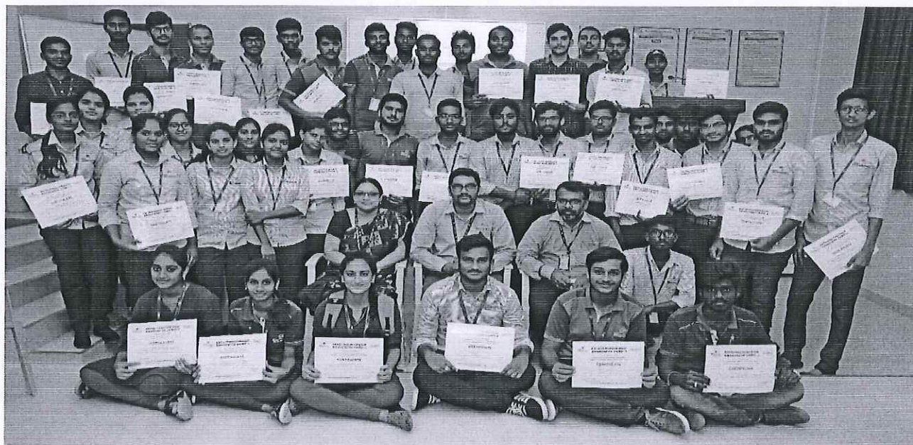
Group photo with the students

A total number of 75 students from III/IV B.Tech. were participated in this camp and motivated, enhanced their entrepreneurship knowledge by series of expert lectures and Industry visit.