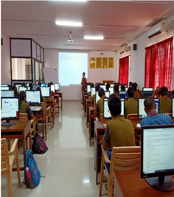
Lecture by APSSDC mentors