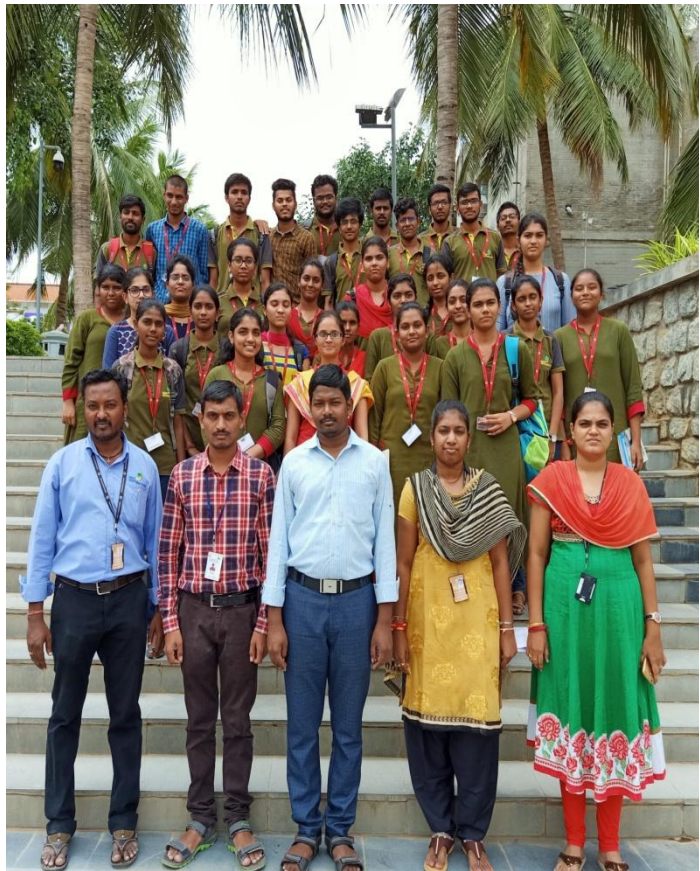
Participants, and faculty organizers with mentors