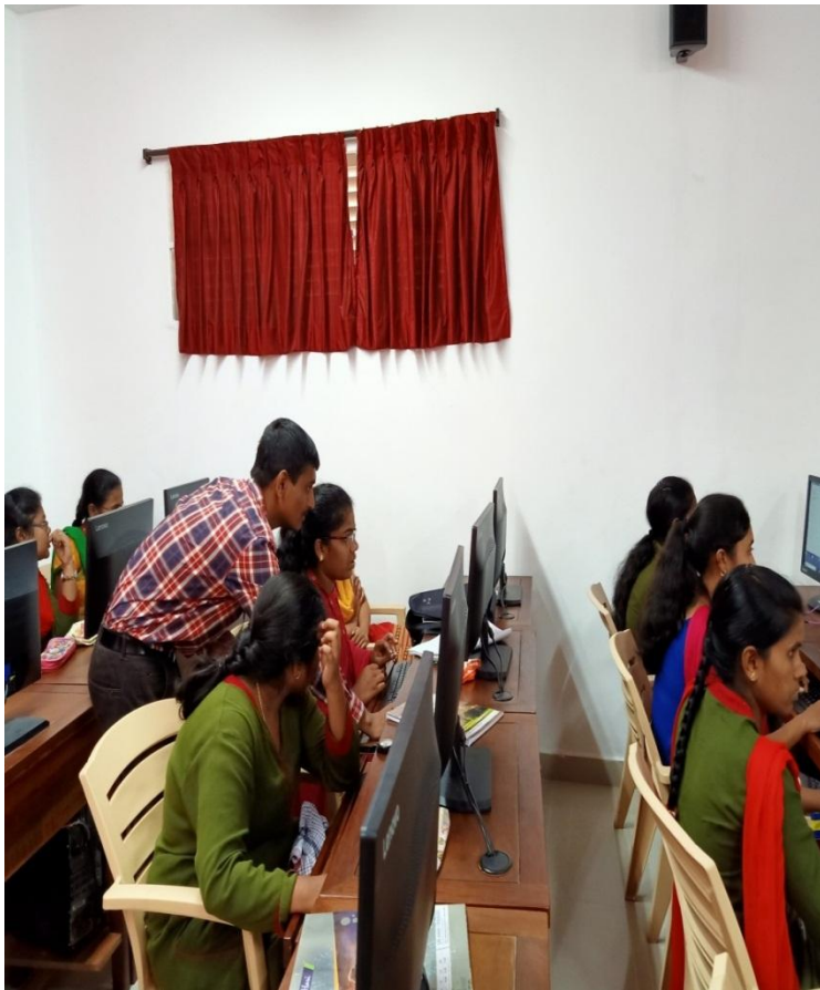
Mentors clarifying doubts to students