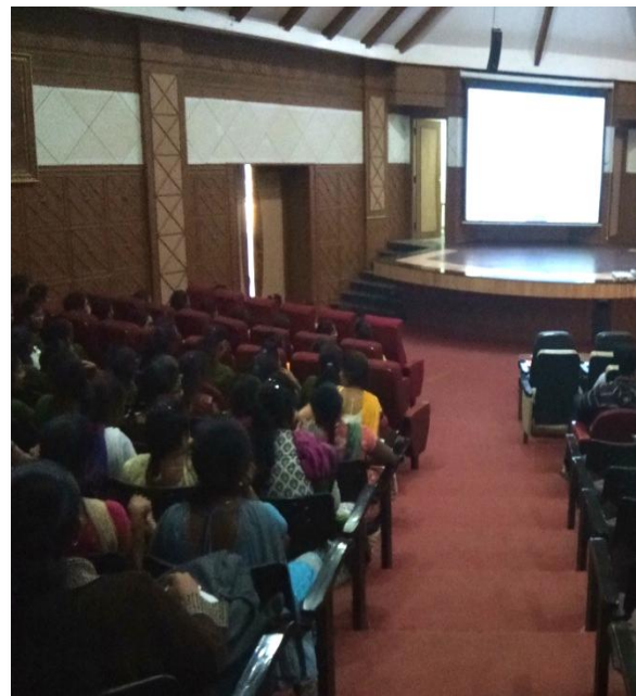
Students & Faculty participating in the Sessions