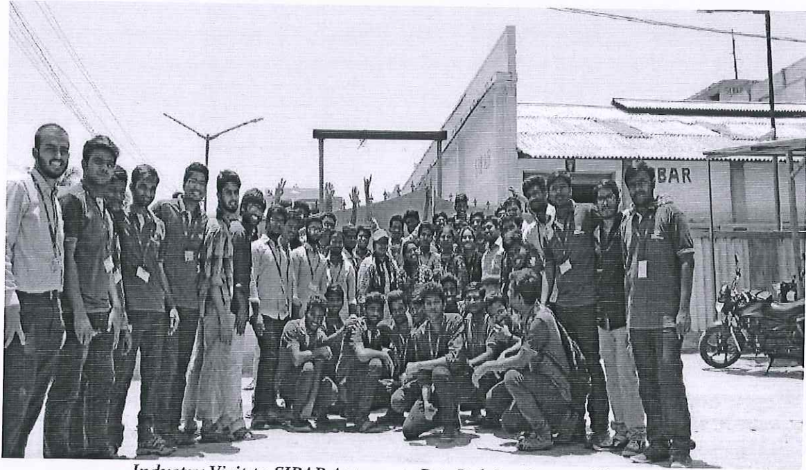
Industry Visit to SIBAR Autoparts Pvt. Ltd. Renigunta, Tirupati

As a part of EAC, students visited Sibar Autoparts , Pvt. Ltd., Renigunta and experienced various operations undertaken in the industry.