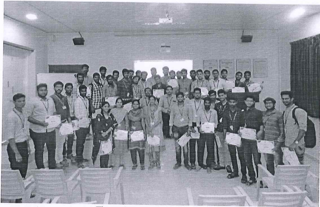
The student participants during valedictory

It was an enriching experience to the students to learn from the awareness camp about entrepreneurship and opportunities.