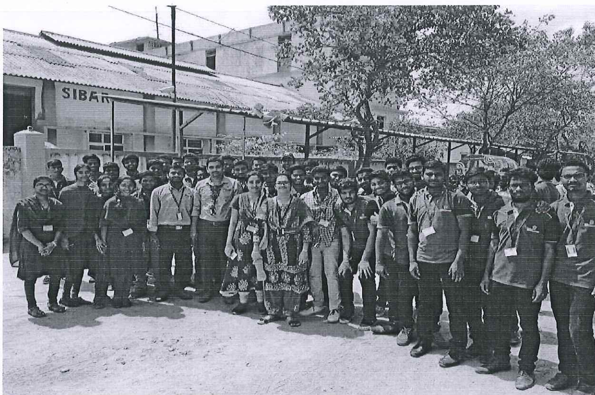
Industry visit to SIBAR Autoparts Pvt. Ltd. Renigunta

A total number of 62 students participated and benefitted from the awareness camp and industrial visit.