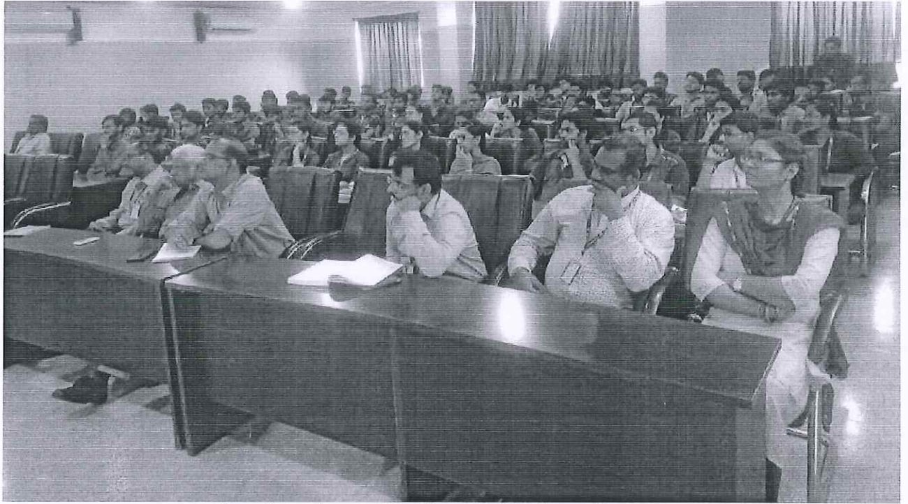
Panel members and Students during the session

COORDINATOR ENTREPRENEURSHIP DEVELOPMENT CELL SREE VIDYANIKETHAN ENGINEERING COLLEGE (AUTONOMOUS) SREE SAINATH NAGAR, A.RANGAMPET TIRUPATI-517 102