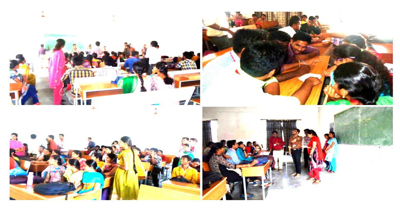
Fig: Students actively participating in the phase events

ACME helps students to strengthen their mental as well as physical capabilities. Keeping this motto in View, ACME Cricket cup and Chess tournament were conducted. These events gained a good response from students.