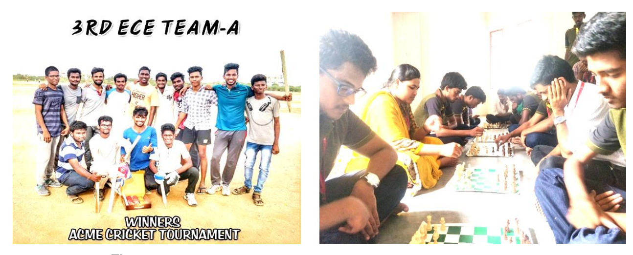
Fig: ACME Cricket Cup Winners and ACME Chess Tournament

ACME helps students to strengthen their mental as well as physical capabilities. Keeping this motto in View, ACME Cricket cup and Chess tournament were conducted. These events gained a good response from students.