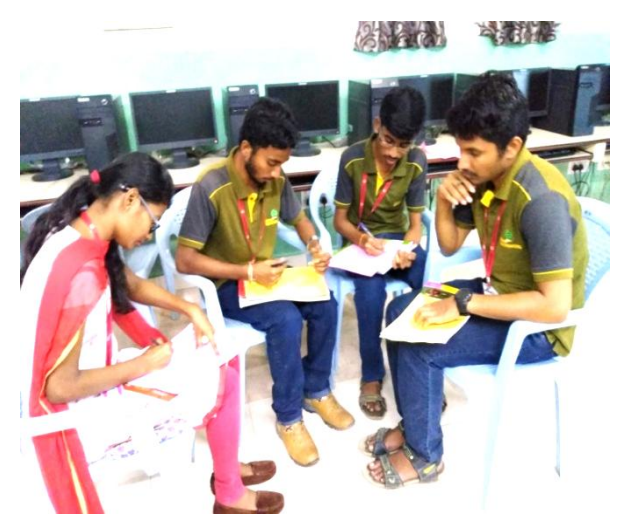
Fig: Students participating in Student Development Program

So finally ACME events were conducted to the students, by the students to enhance skills among them which are helpful to lead a successful future.