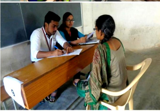
Fig: Students participating in Placement Activates (Group Discussion and Mock Interviews)

This year a Student Development Program was conducted on "EPICS-Design Thinking Course". The Program was conducted to impart patience listening skills among the students. This also helped students to understand the significance of inculcating practice before attempting an empathic design.