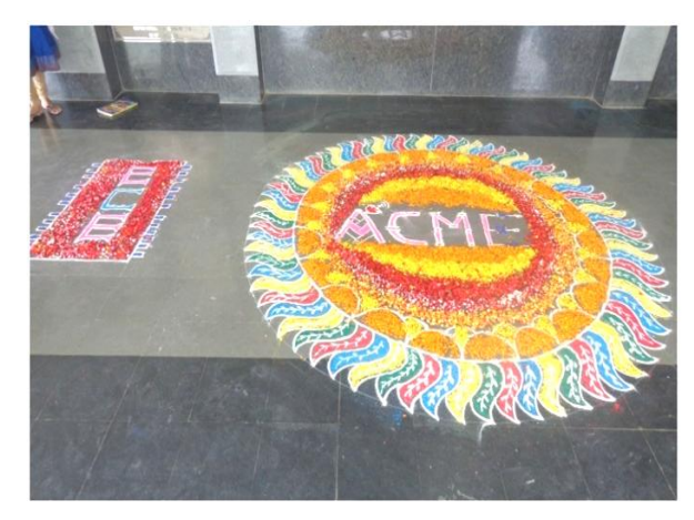
Fig: Students decorating Dasari Auditorium for ACME Activities

This year, an overall of 19 Events were conducted in three phases. A total of 1670 students were participated and 132 students bagged prizes.