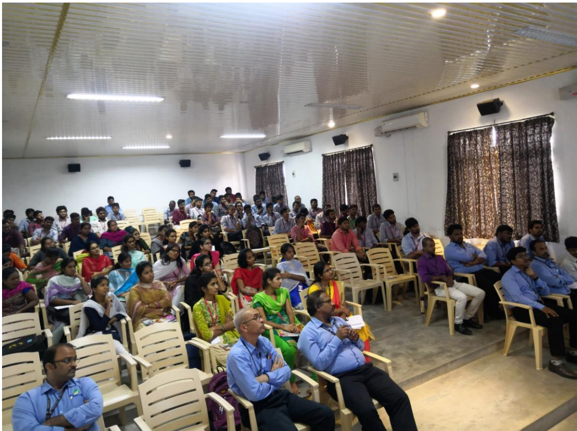
Faculty and Students Listening to the Expert