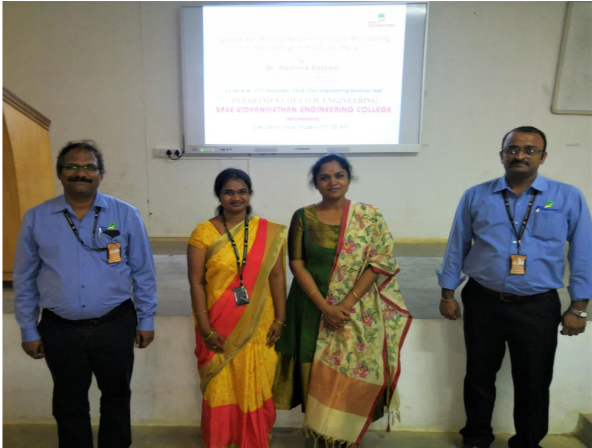
Group Photo with Expert