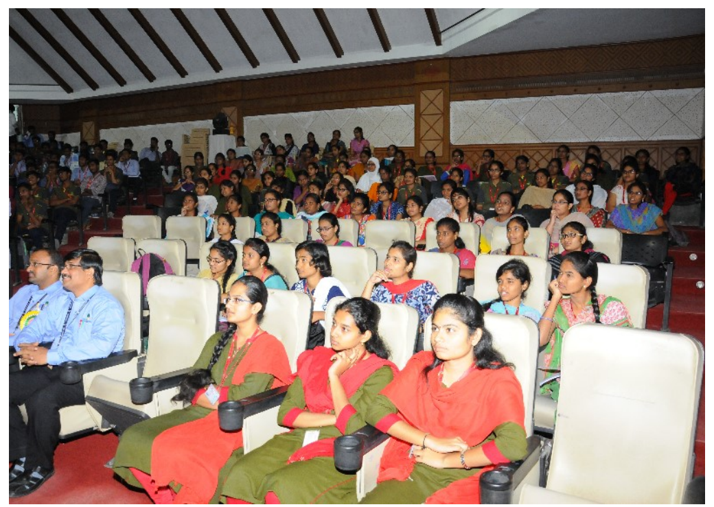
Students Listening to the Panelists