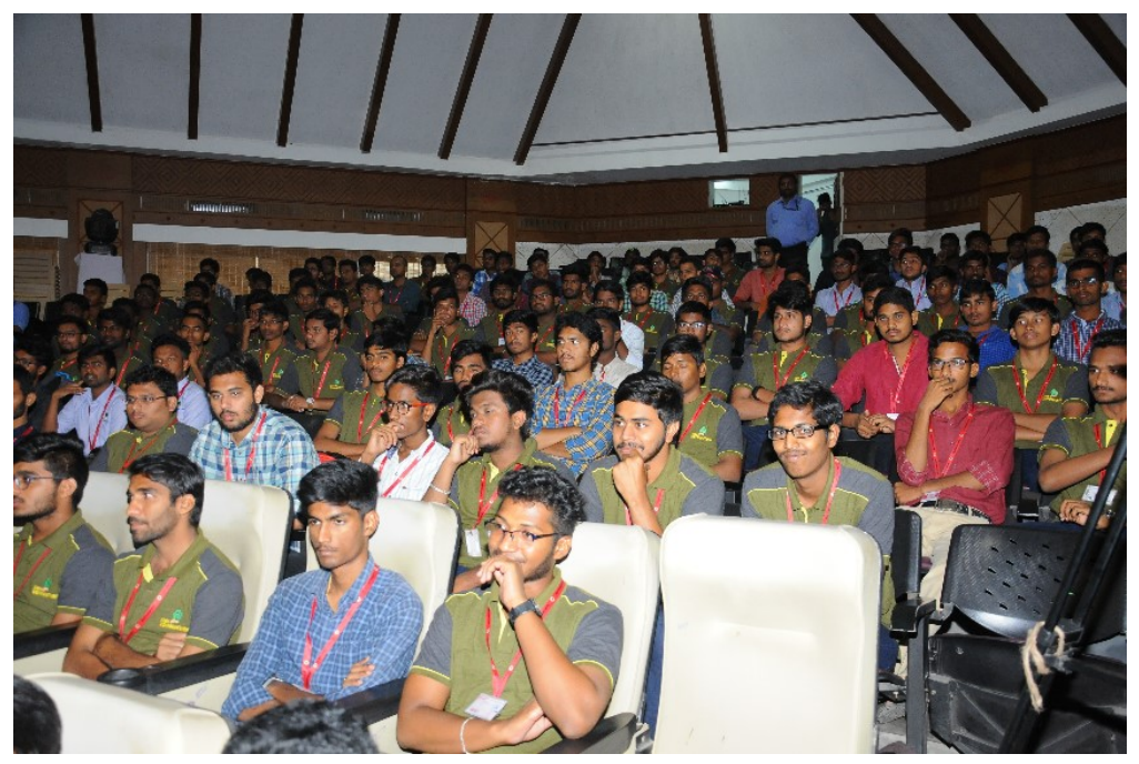
Students Listening to the Panelists