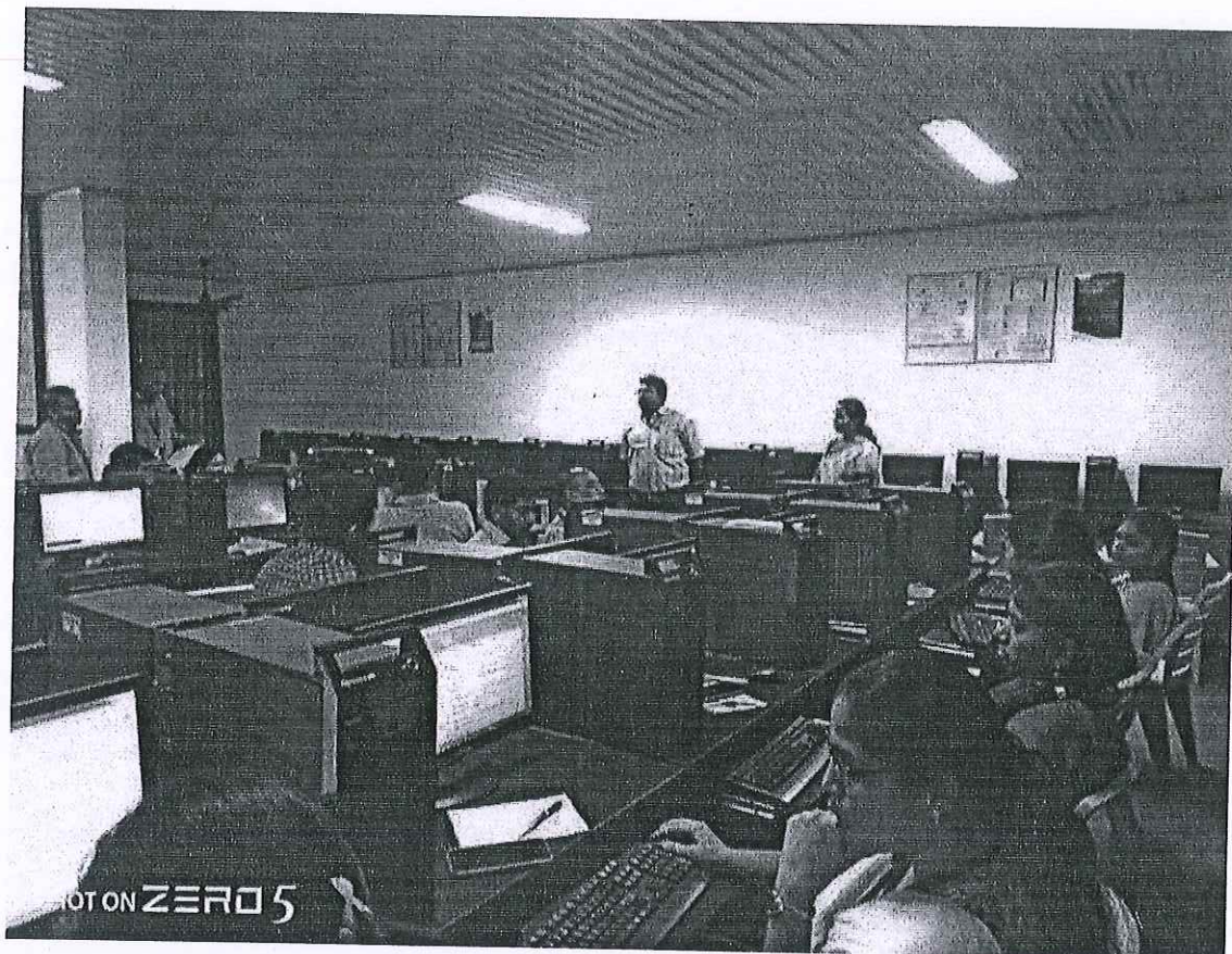
Participants Feed Back