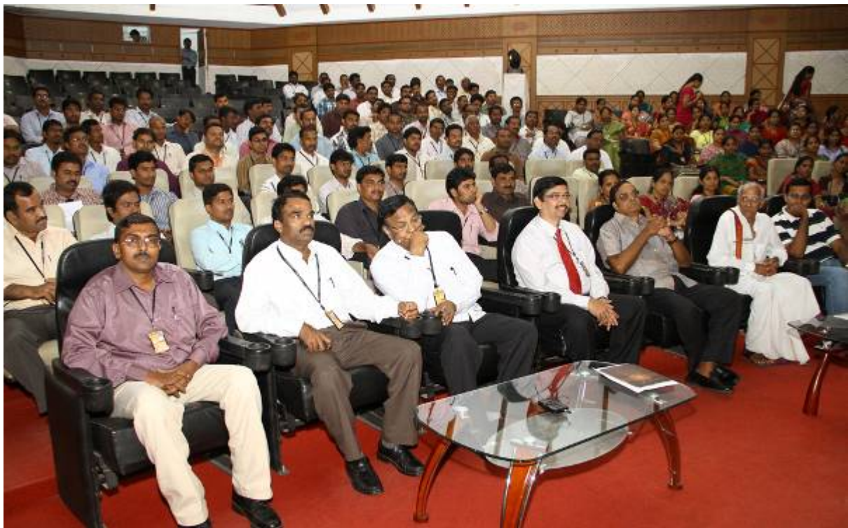
Participants at the Celebrations