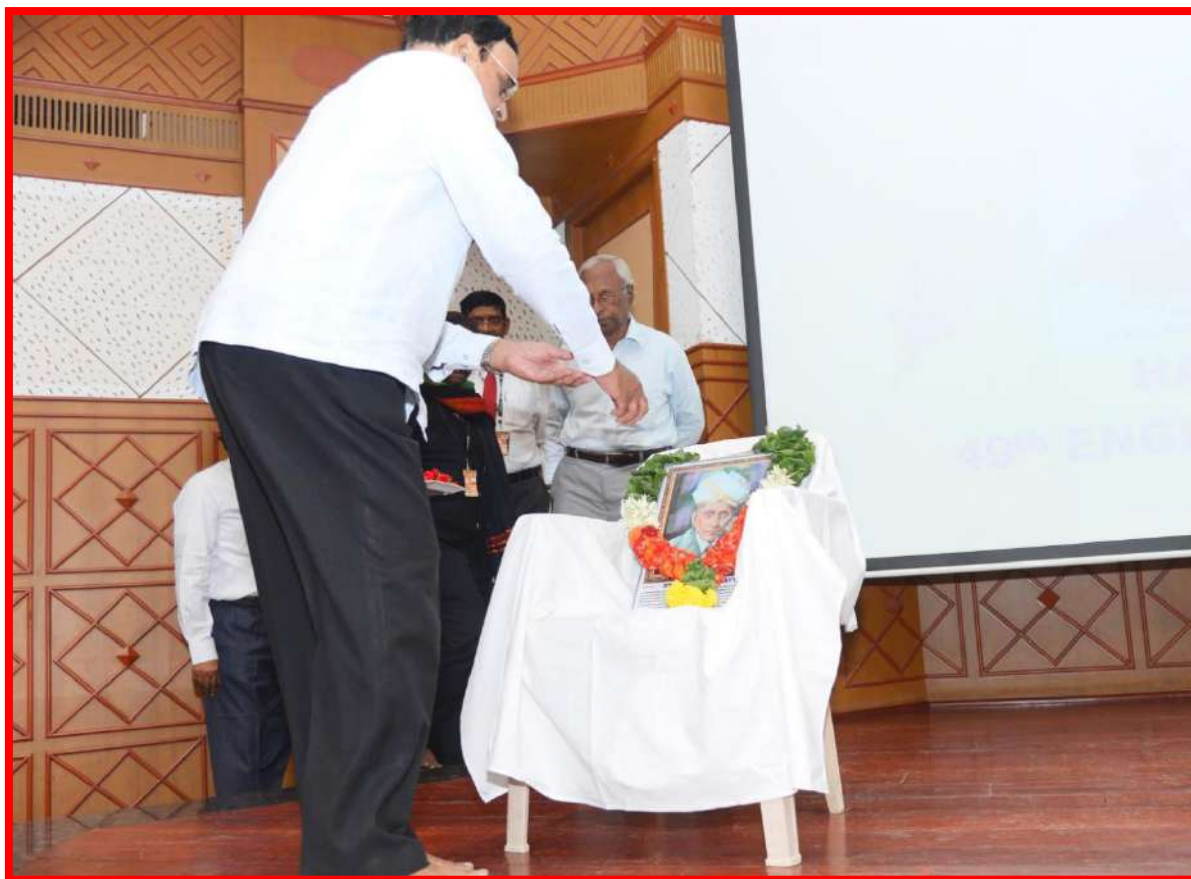
Tributes being paid to Bharat Ratna Sir Mokshagundam Visvesvaraya by the Dignitaries