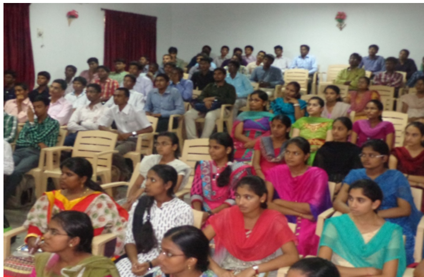
Audience listening keenly to the talk

The expert was of the opinion that a cooperative integrated society is congenial for leading a healthy social life. He concluded that strategies to prevent communal violence need to be developed to strip the community off the violence.