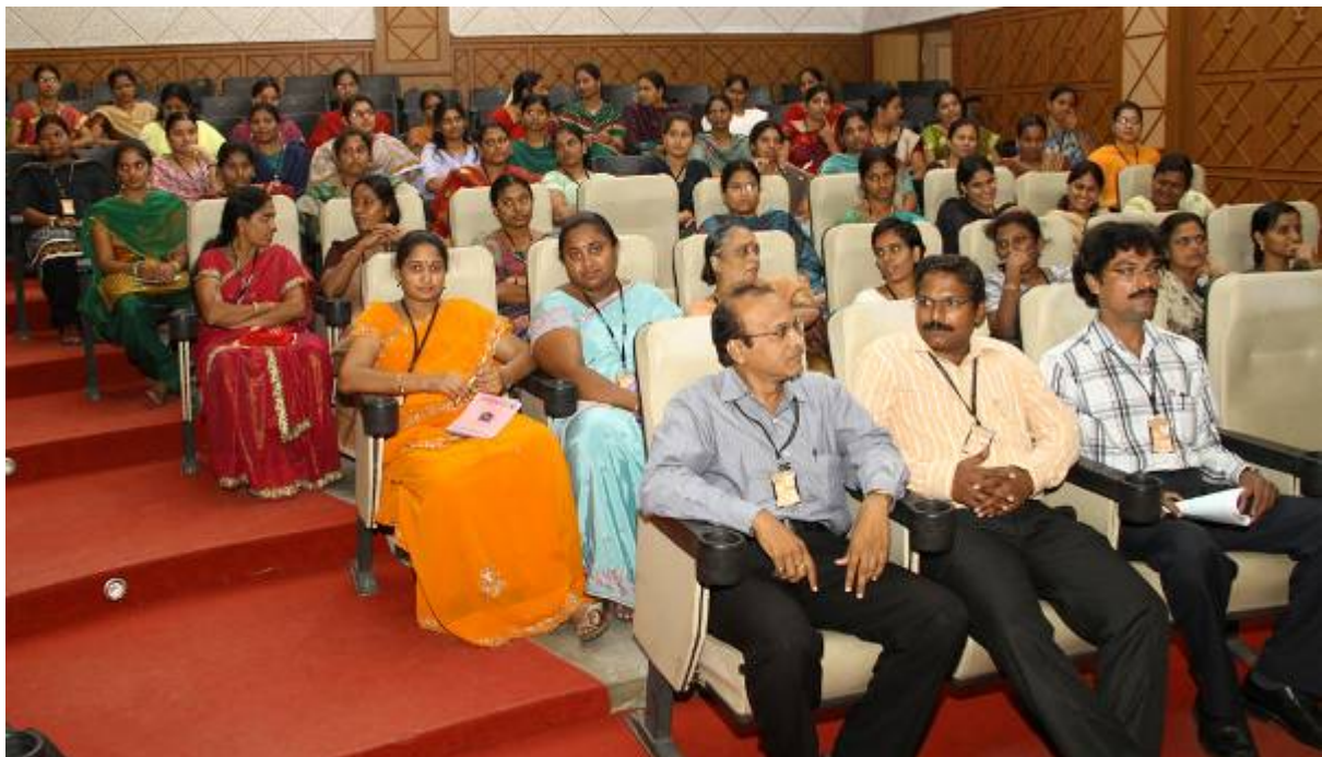
Participants at the Celebrations