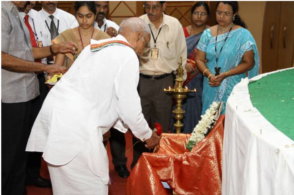
The Chief Guest Lighting the lamp