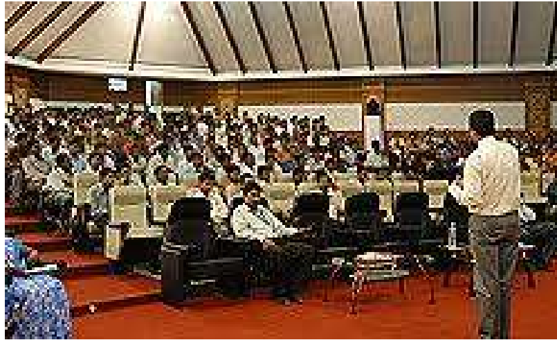
Audience listening to the Speaker