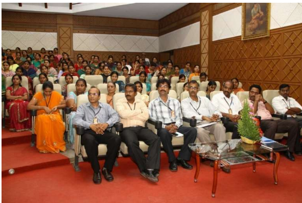
Members of Faculty attending the 46 th Engineers Day Celebrations