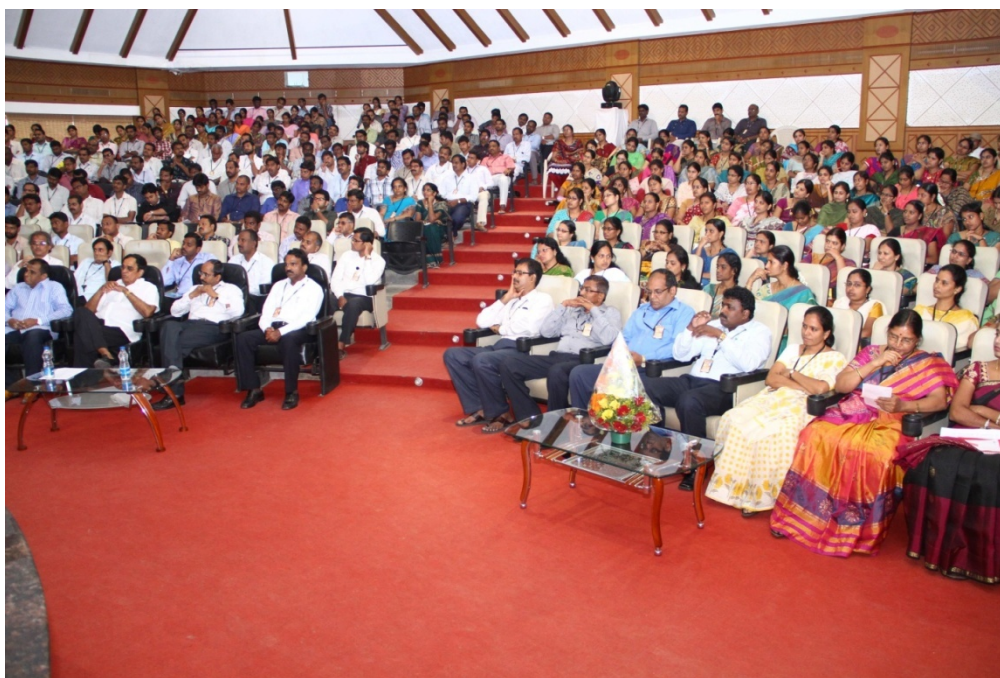
Officials and Members of Faculty on the Eve of Engineers’ Day 2014

Sir Mokshagundam Visvesvaraya’s invaluable services to the nation were recalled and also deliberated on. The teaching fraternity gathered to deliberate on the role of engineers in Nation’s Development. At the departmental level, number of activities like quiz, essay writing competition, poster presentation and group discussion took place all through the day.