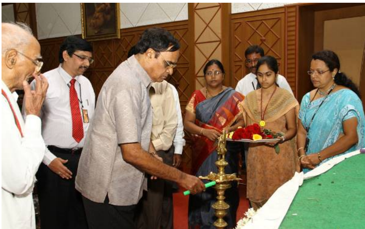
Special Officer Lighting the Lamp