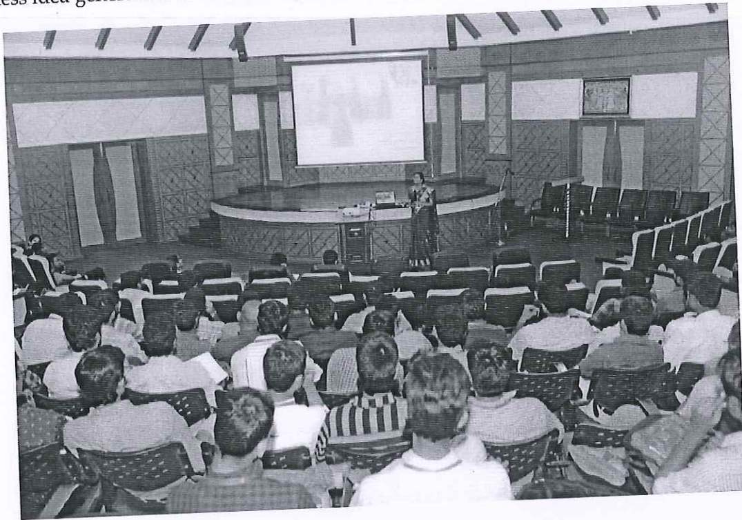
Students attended the programme on 11.03.2017

After attending the workshop, students felt equipped with knowledge and skills for business idea generation and business plan preparation.