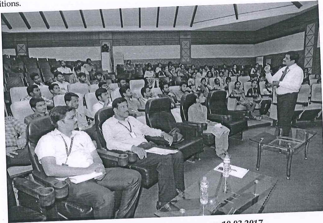
Students attended the programme on 10.03.2017