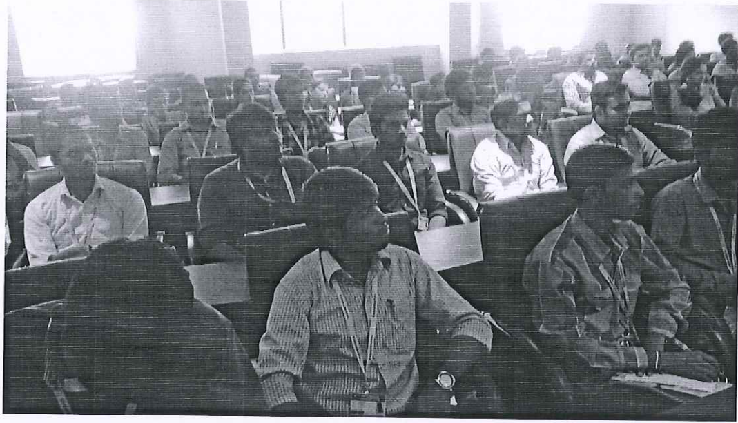
Students participation during the workshop

The sessions on both days went well and students gained the knowledge on Startups. Some of the students had shown interest to work on their ideas to start the startups.