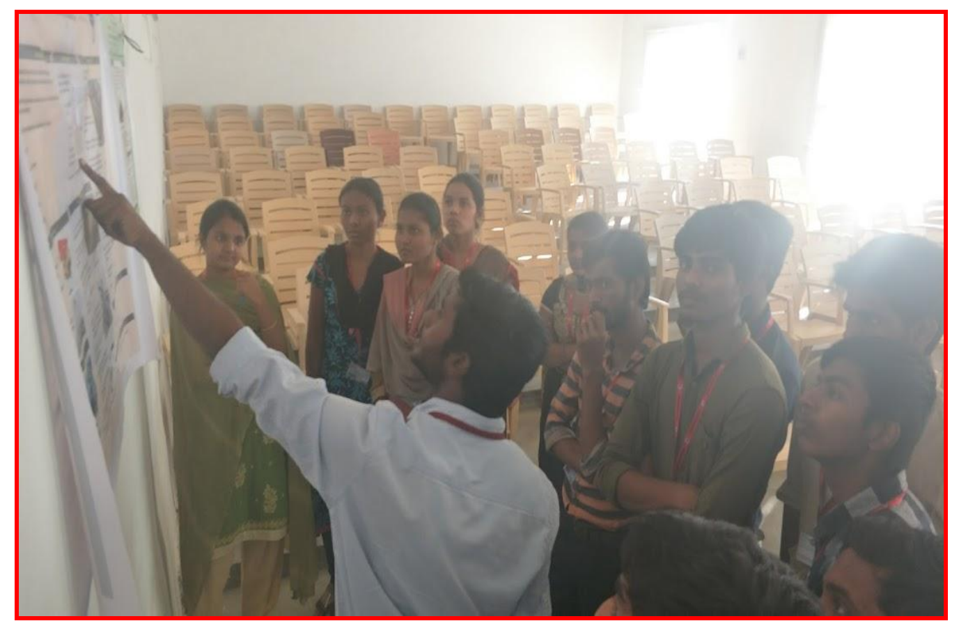
Students Listening to the Poster Presentation