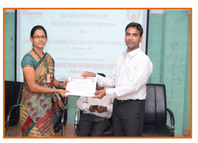
Certificate Distribution to Participants.