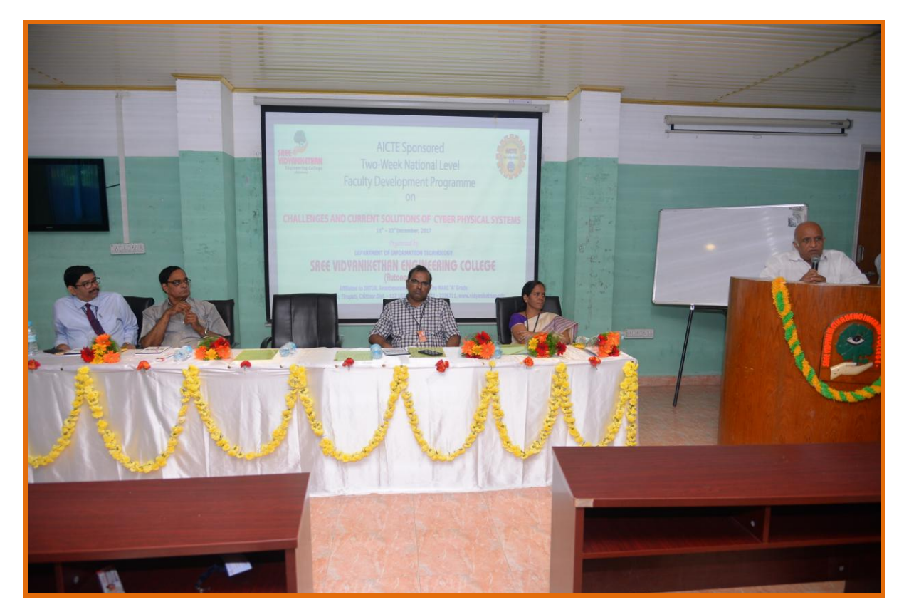
Dignitaries on the Dias during Inauguration