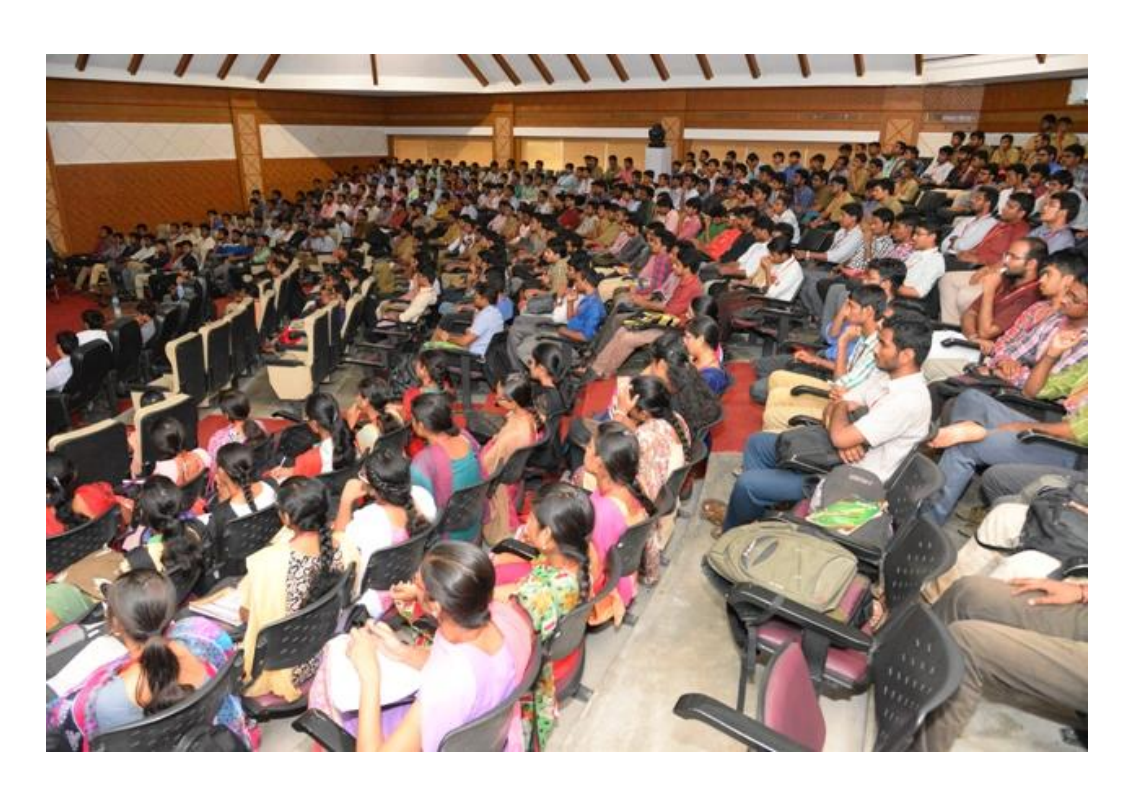
Students of Mechanical Engineering taking Participation in the Program.