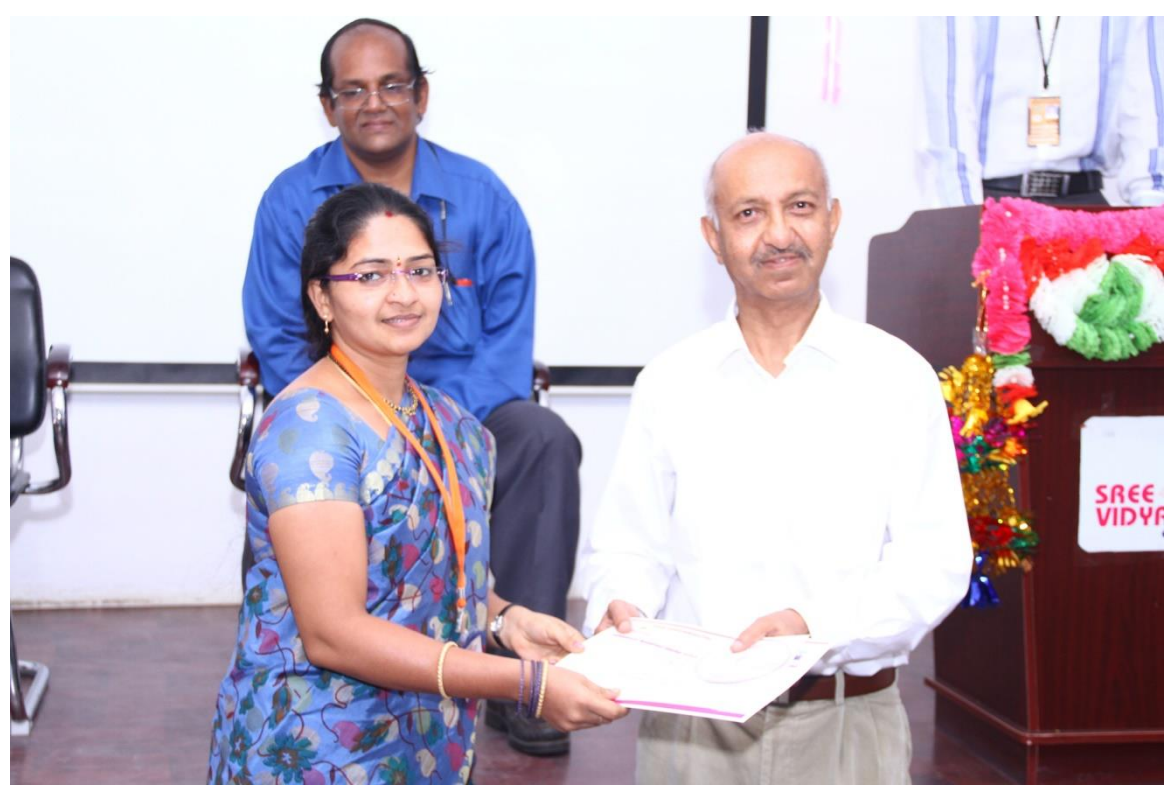
Participants were presented certificates by the Chief Guest