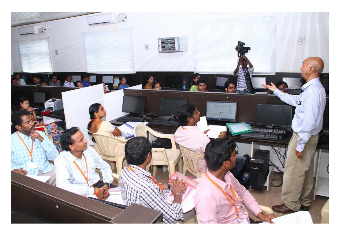
Participants were given hands-on-training on various case studies